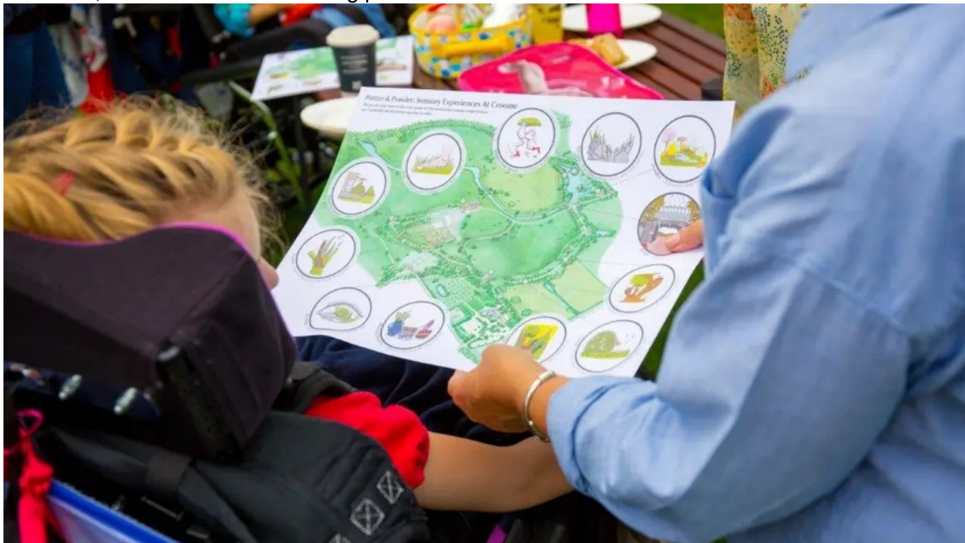
The Potter and Ponder sensory map