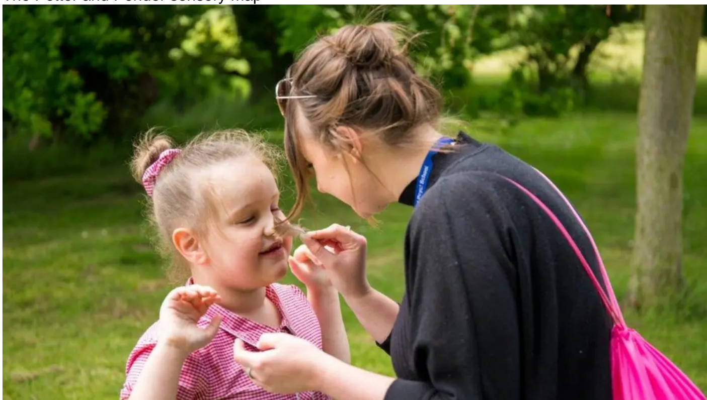
A little girl discovers the outdoors through sensory activities