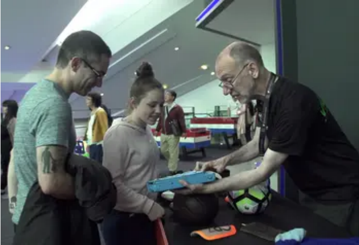
ce to forests