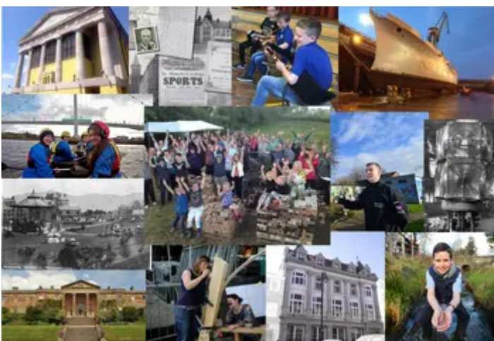
h National Lottery funding