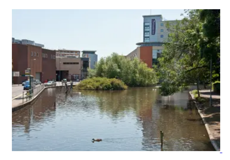
View of the Water Gardens and the town

Jellicoe Water Gardens is now welcoming visitors, and you can visit <u>Dacorum Borough Council's website</u> for more information.