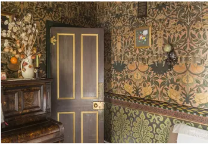
Kitchen wall design in David Parr House David Parr House