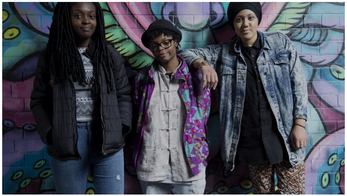
Young creative minds from Birmingham's HLF-supported Routes2Roots campaign reveal what heritage means to them - and how the project has inspired them.

Ten young people volunteered their time and passion in co-creator roles throughout the campaign, ranging from creative director to social media expert.