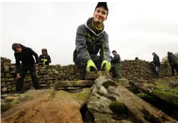
A trainee learns dry stone walling on an HLF project in the North West