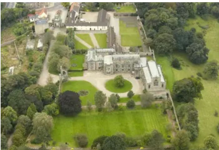
Aerial view of Auckland Castle

Heritage Hunters: young people help open up Auckland Castle thanks to