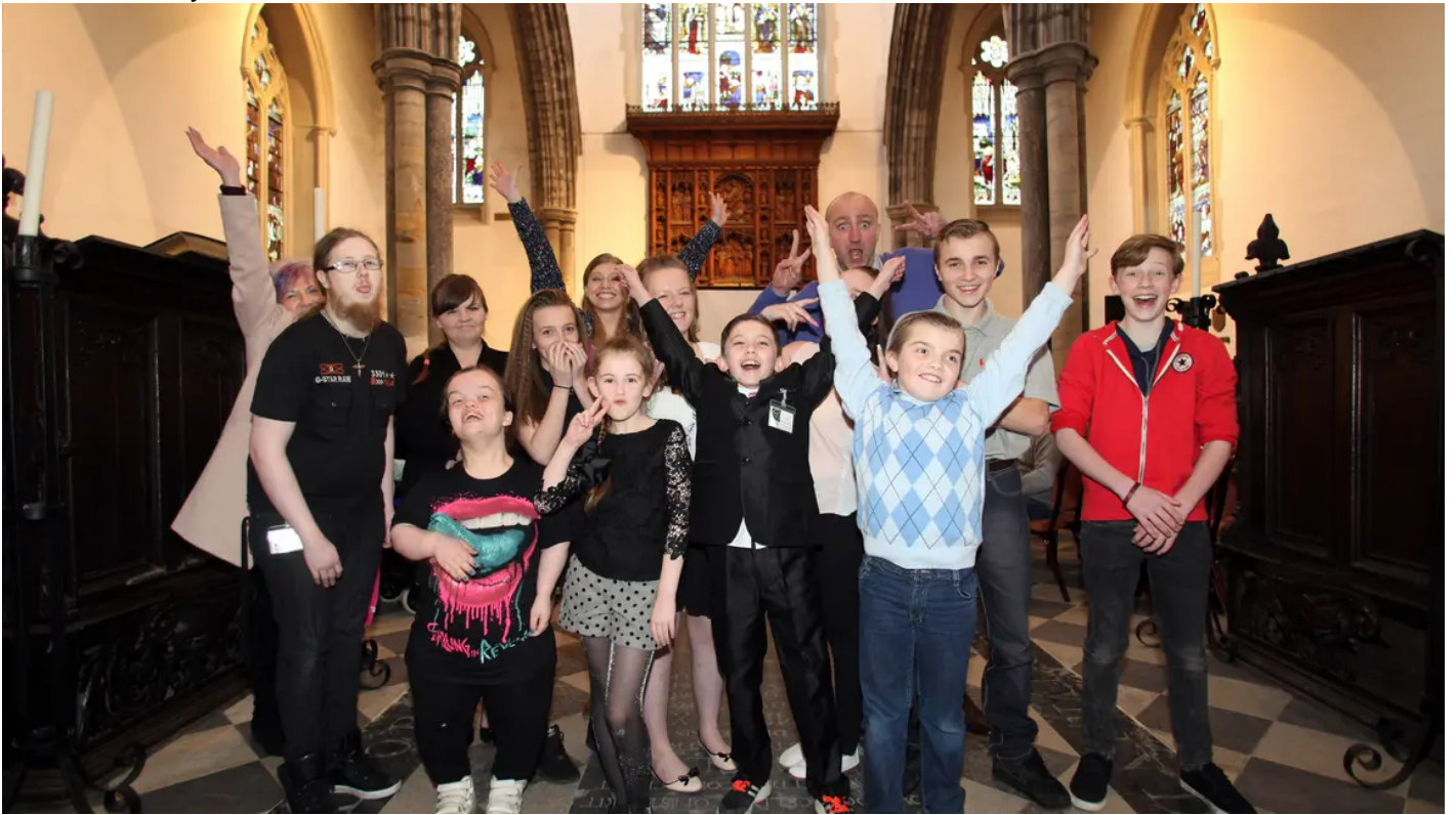
The Heritage Hunters celebrate their success