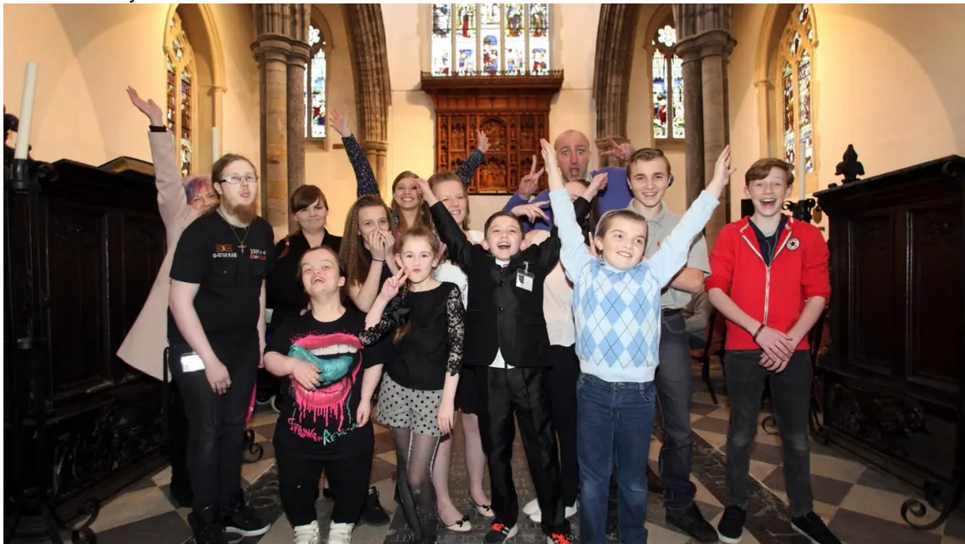
The Heritage Hunters celebrate their success