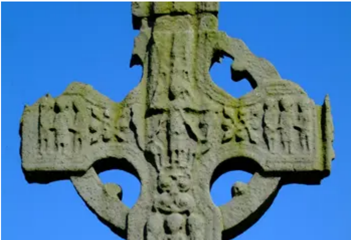
Ardboe High Cross near Lough Neagh

HLF has already invested £37.6m in Northern Ireland's natural heritage which is helping to conserve key habitats and species, restore historic built heritage features and reconnect people to their local landscapes.