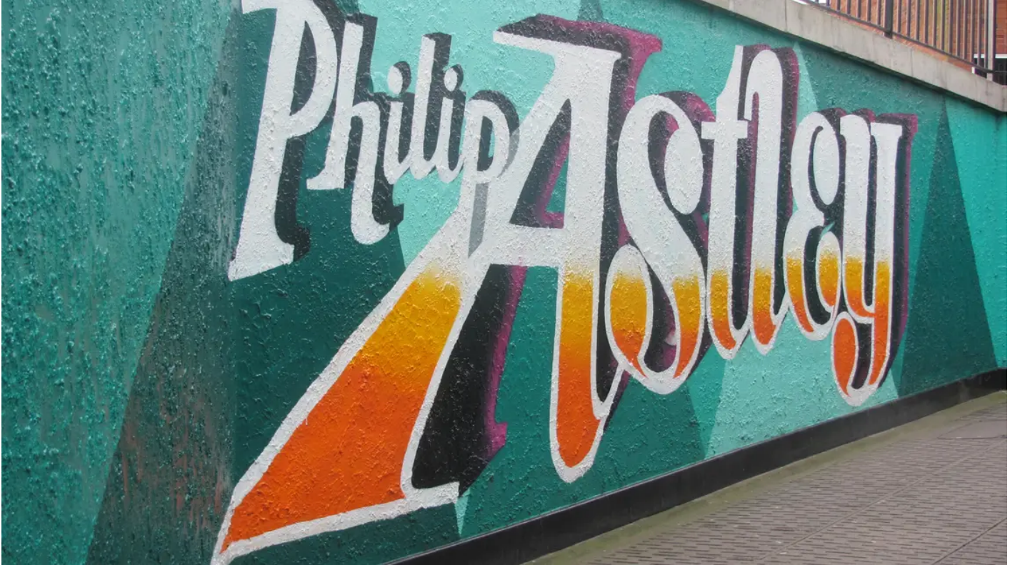
Philip Astley subway art

2018 marks the 250th anniversary of the invention of the modern circus ring by Philip Astley, born in Newcastle-under-Lyme in 1742.