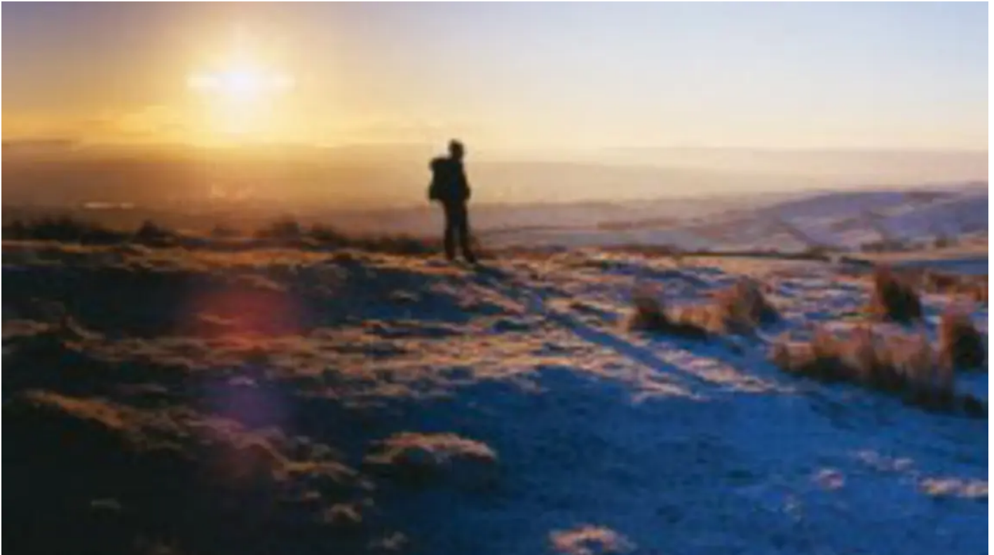
Pendle Hill at sunset

The area around Pendle Hill has long been associated with the story of 10 local people accused of witchcraft during the 17th century. However, the area has a wide and fascinating heritage and the Pendle Hill Partnership is now set to help people gather and research this wealth of history, including the founding of the Quaker movement by George Fox.