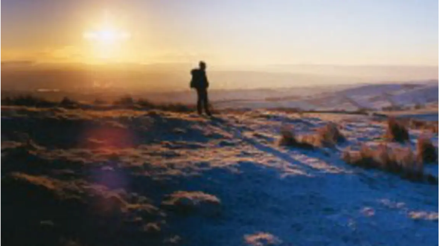
Pendle Hill at sunset

The area around Pendle Hill has long been associated with the story of 10 local people accused of witchcraft during the 17th century. However, the area has a wide and fascinating heritage and the Pendle Hill Partnership is now set to help people gather and research this wealth of history, including the founding of the Quaker movement by George Fox.