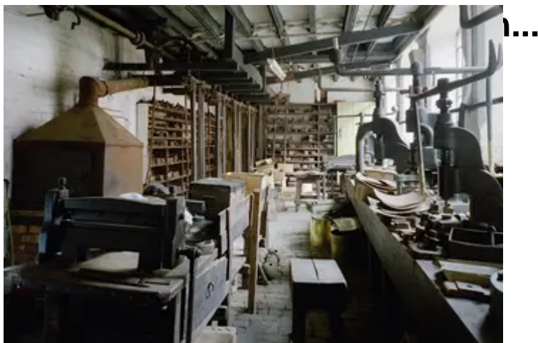
The stamp room in the Newman Brothers Coffin Works in Birmingham

See the latest findings on the Heritage at Risk website .