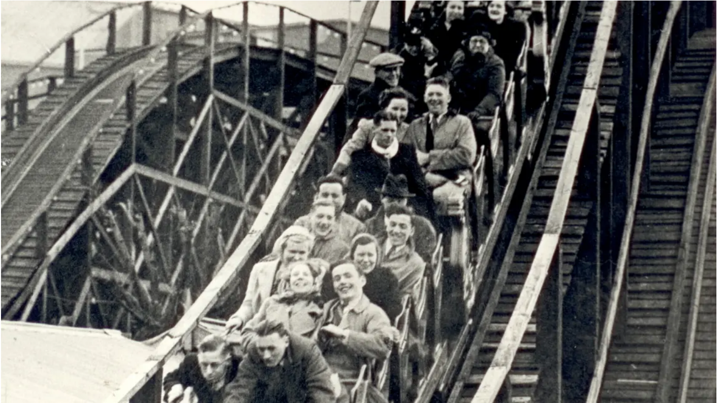
Dreamland's Scenic Railway in it's 1950s heyday

Historic England unveils its annual register of historic buildings and structures at risk.