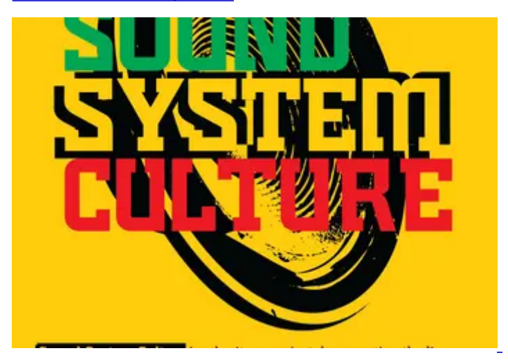
Sound System Culture project flyer