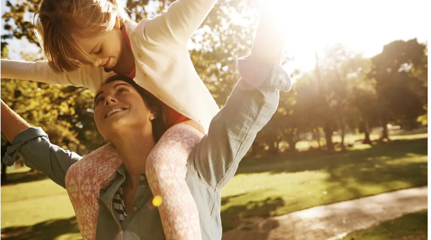
A mother and child have fun in a park