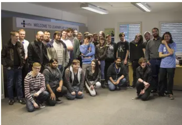
The LearnPlay Foundation team

While the Cornish language is listed endangered by UNESCO it is increasingly being seen as an important and valuable part of Cornwall's culture. The Taves and Tir project is tracking the language's lasting legacy in placenames and family surnames to reconnect the local community with their heritage. Find out more on the Kowethas an Yeth Kernewek website .