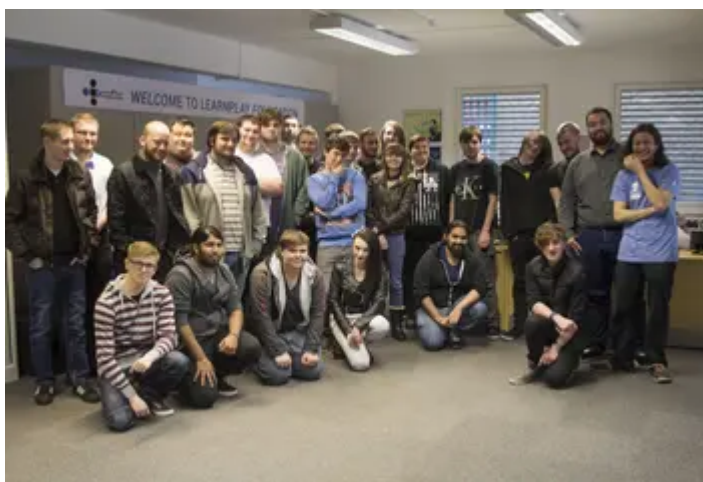
The LearnPlay Foundation team

While the Cornish language is listed endangered by UNESCO it is increasingly being seen as an important and valuable part of Cornwall's culture. The Taves and Tir project is tracking the language's lasting legacy in placenames and family surnames to reconnect the local community with their heritage. Find out more on the Kowethas an Yeth Kernewek website .