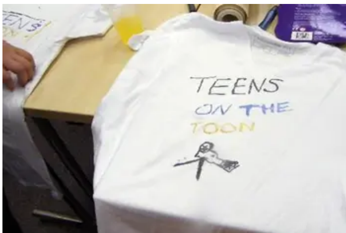
Teens on the Toon Country longwidge!