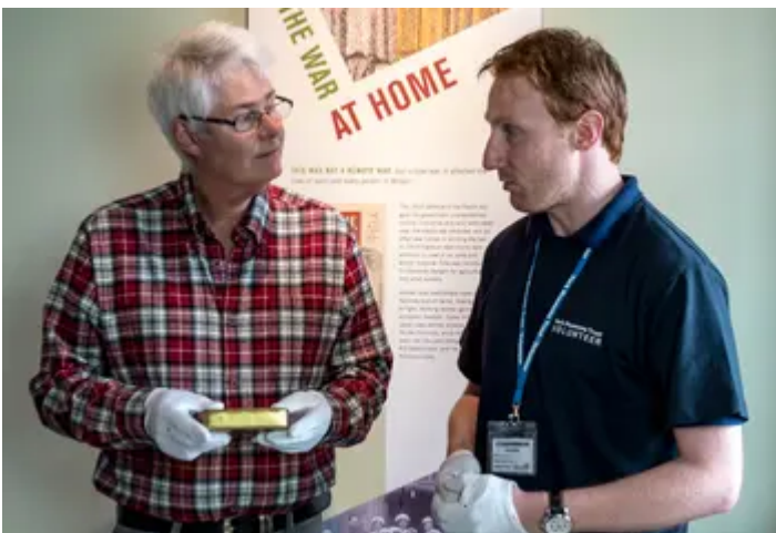
Volunteer at the Hands on Here exhibition at York Castle Museum