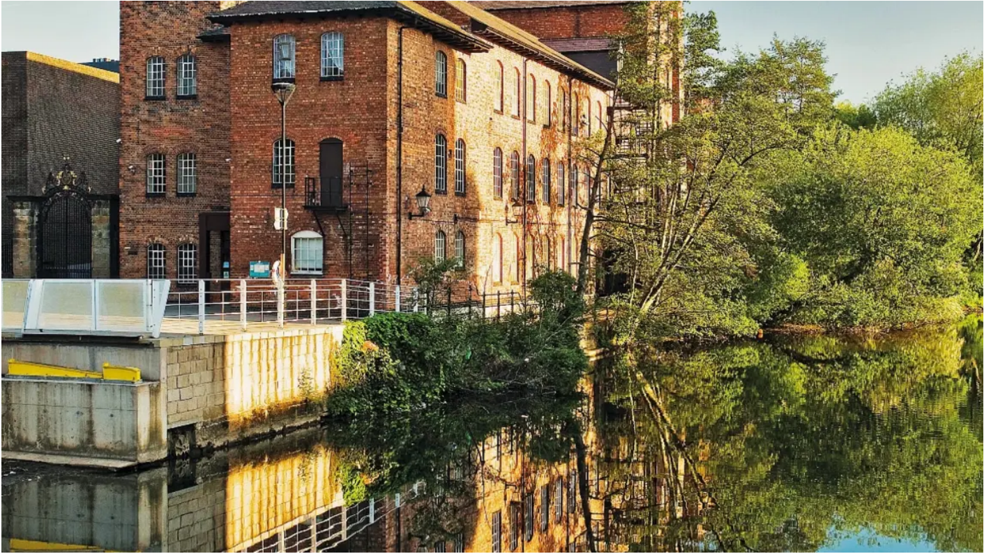
Derby Silk Mill in the Derwent Valley

Nine projects are set to receive nearly £100m National Lottery investment, creating a huge boost for UK's scientific, industrial and cultural heritage.