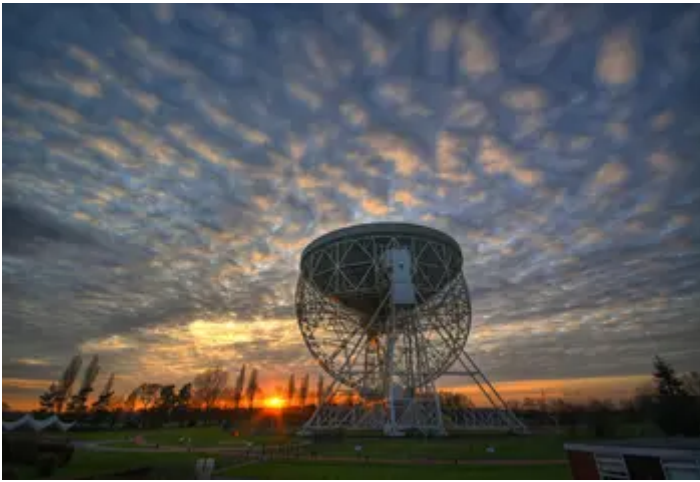
The Lovell Telescope at Jodrell Bank at sunset