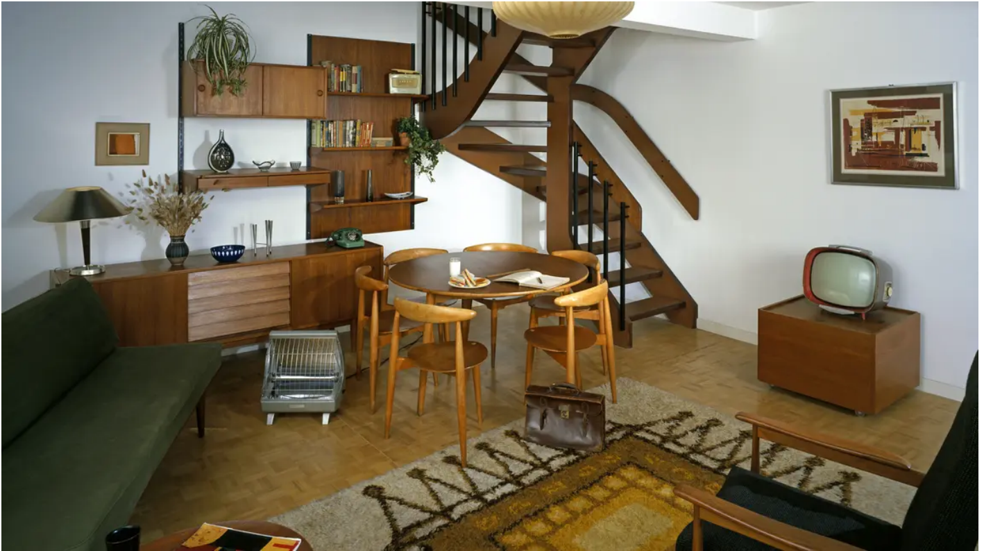
Display of a living room from 1965 Geffrye Museum of the Home

The £15m scheme, designed by Wright & Wright Architects, will breathe new life into the existing 18th-century buildings by opening up and making much better use of areas previously unseen by the public. Structural and environmental improvements will safeguard the museum's Grade I listed buildings for the future and allow much more of the Geffrye's collections to be on display and housed in good conditions.