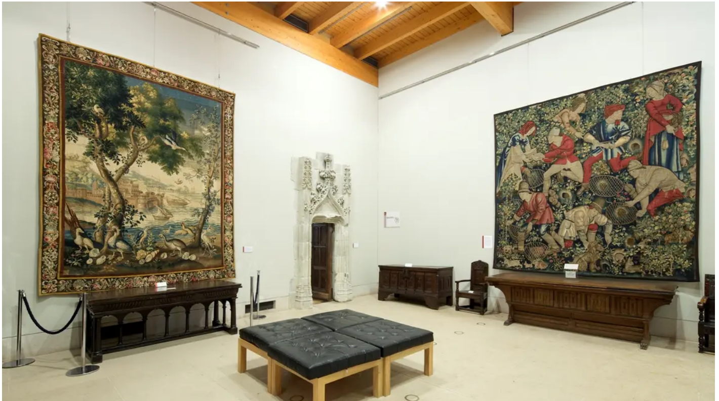
Inside one of the galleries in the Burrell Collection

Today, HLF's UK Board announced support of £15million for the transformation of the Burrell Collection including the award of a grant of £1million to assist Glasgow City Council and Glasgow Life in developing the project to the next stage of the application process.