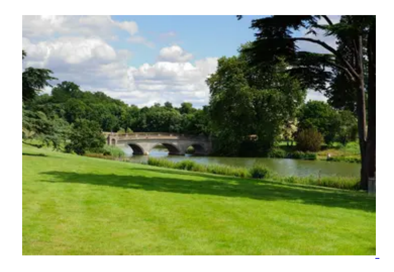
The East Lawn at Compton Verney Compton Verney

If you are feeling inspired by the heritage of landscapes and garden or are interested in <u>Young Roots</u> then get in touch with the <u>Yorkshire</u> and the <u>Humber Development Team</u>.