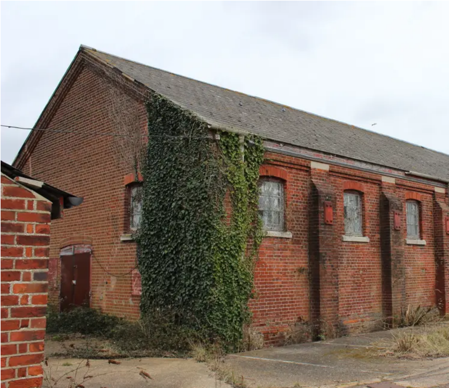
Priddy's Hard in Gosport

The grant is part of the HLF's Heritage Enterprise programme, targeting projects which create new sustainable economic uses for derelict historic buildings.