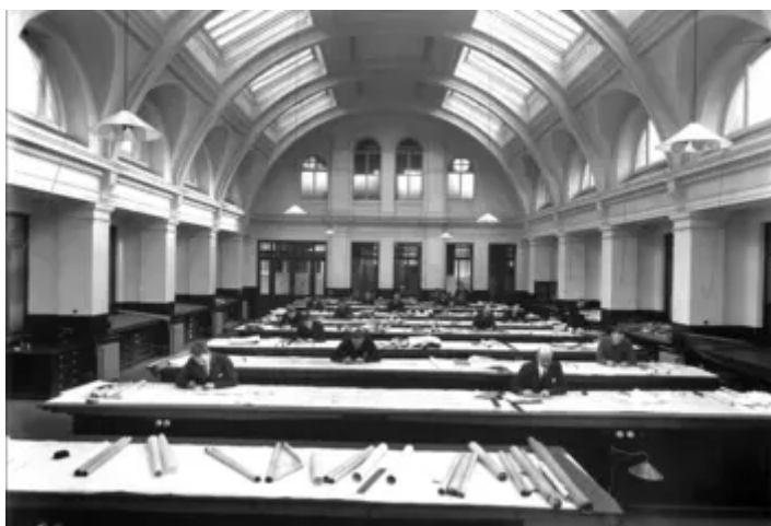
The Harland and Wolff drawing offices in Belfast