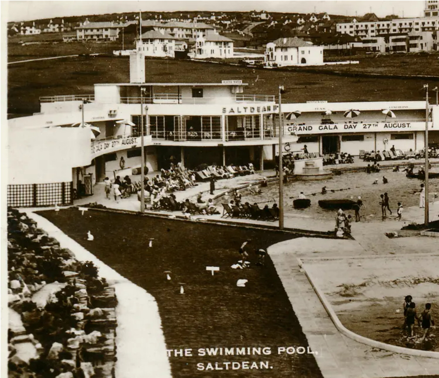
Saltdean Lido in its 1930s heyday

Today, the Heritage Lottery Fund (HLF) has announced initial funding to help restore and reopen to the public Saltdean Lido, England's only Grade II* listed lido.