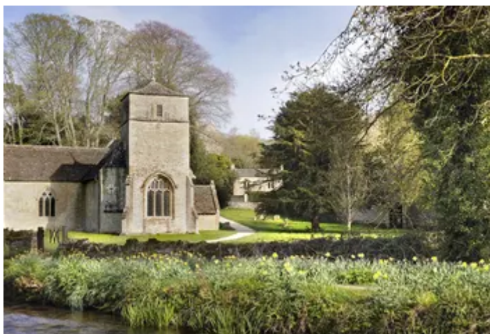
Eastleach Church Churches Conservation Trust