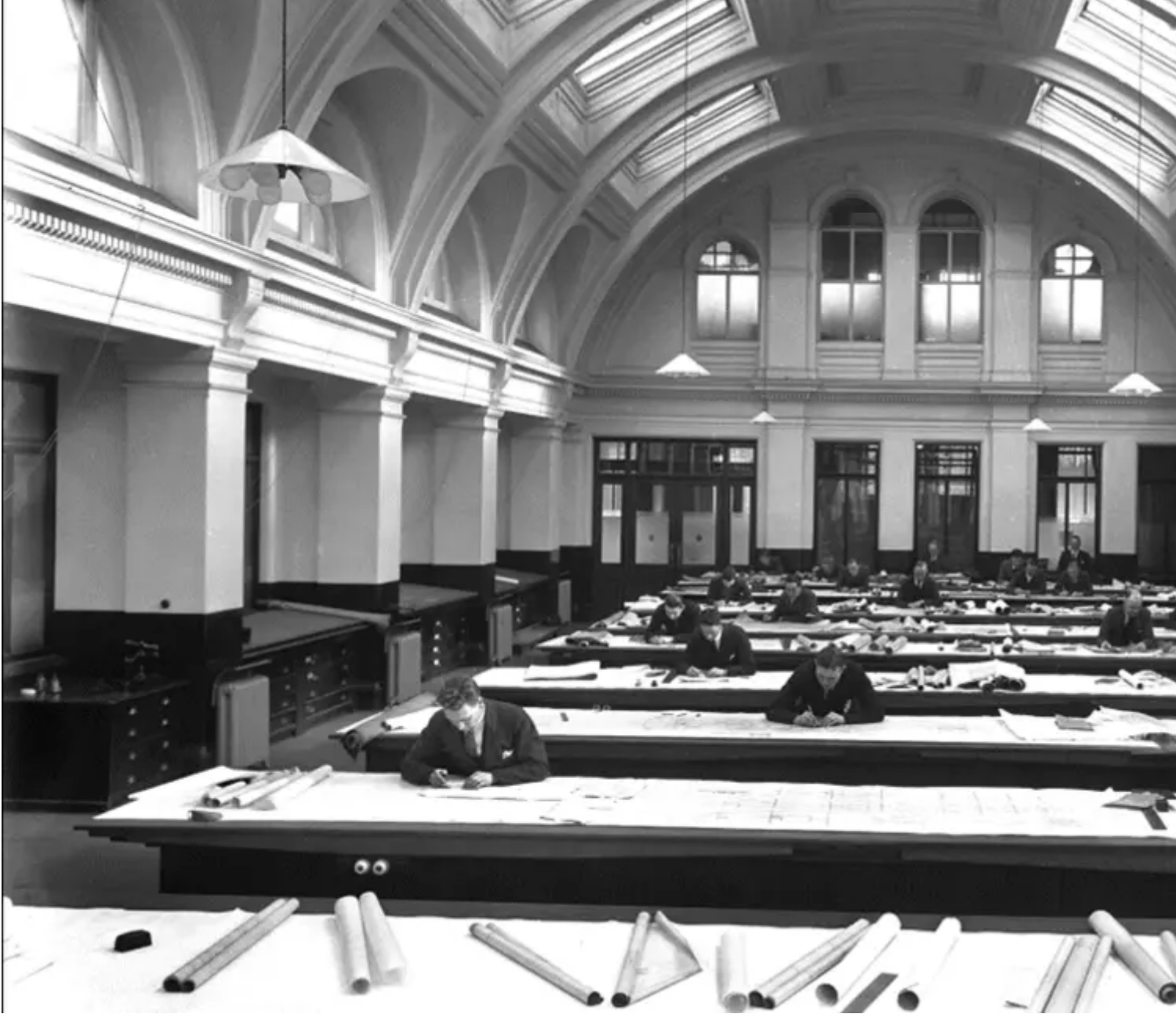
The Harland and Wolff drawing offices in Belfast

A £4.9million grant from the Heritage Lottery Fund (HLF) will enable The Titanic Foundation Ltd. to restore the derelict Harland and Wolff Drawing Offices where RMS Titanic was designed – unlocking plans to develop a luxury 4* hotel in the shipbuilder's former headquarters building.