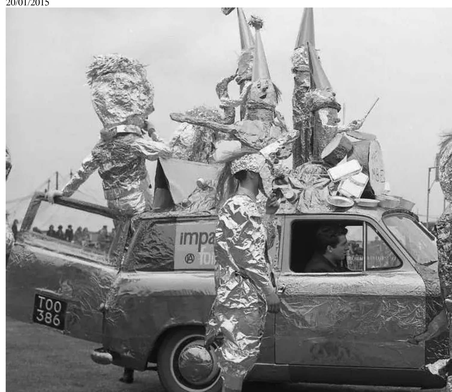
Aliens town show in Barking and Dagenham

Barking and Dagenham is the first London Borough to be awarded an HLF grant for a project to mark the 50th anniversary of the creation of Greater London – called 50 years a London Borough.