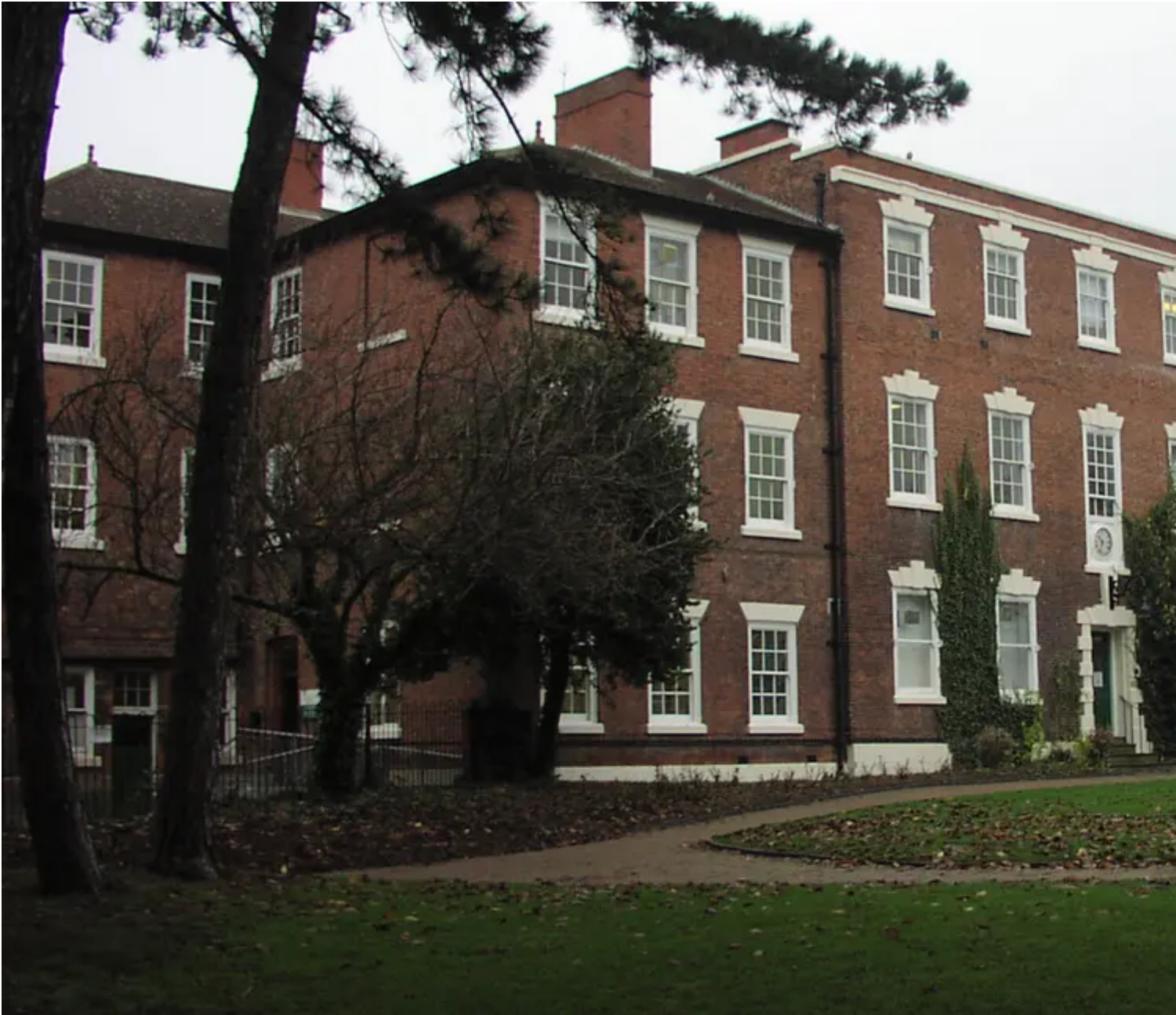
Bridgford Hall, Nottingham

Today, the Heritage Lottery Fund (HLF) is announcing grants totaling £3.3million that will make three vacant and derelict historic buildings commercially viable, putting them back to business use.