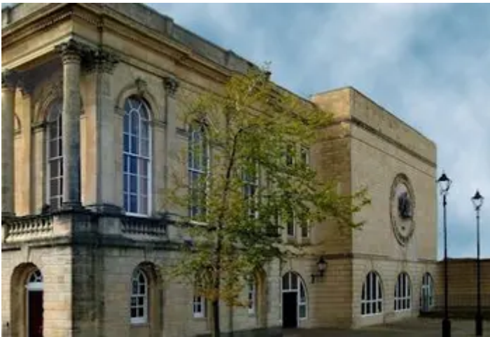
Dylan Thomas Centre, Swansea