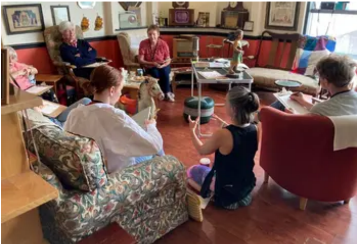
A community group enjoying a reminiscence session at the Wee Museum of Memory.

Head to the National Galleries of Scotland’s YouTube channel to watch videos inspired by the collection or explore the learning programme on their website. Find out more about how we’re supporting museums, libraries and archives across the UK.