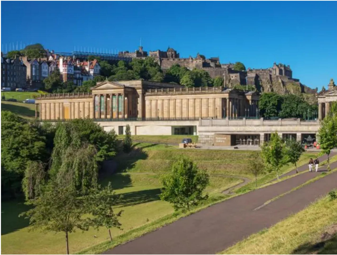
The National in Edinburgh, as seen from Princes Street Gardens.

The project was completed in late summer 2023. It reintroduced visitors to the historic Scottish art collection, which had languished for years in dark, outmoded galleries with poor access.