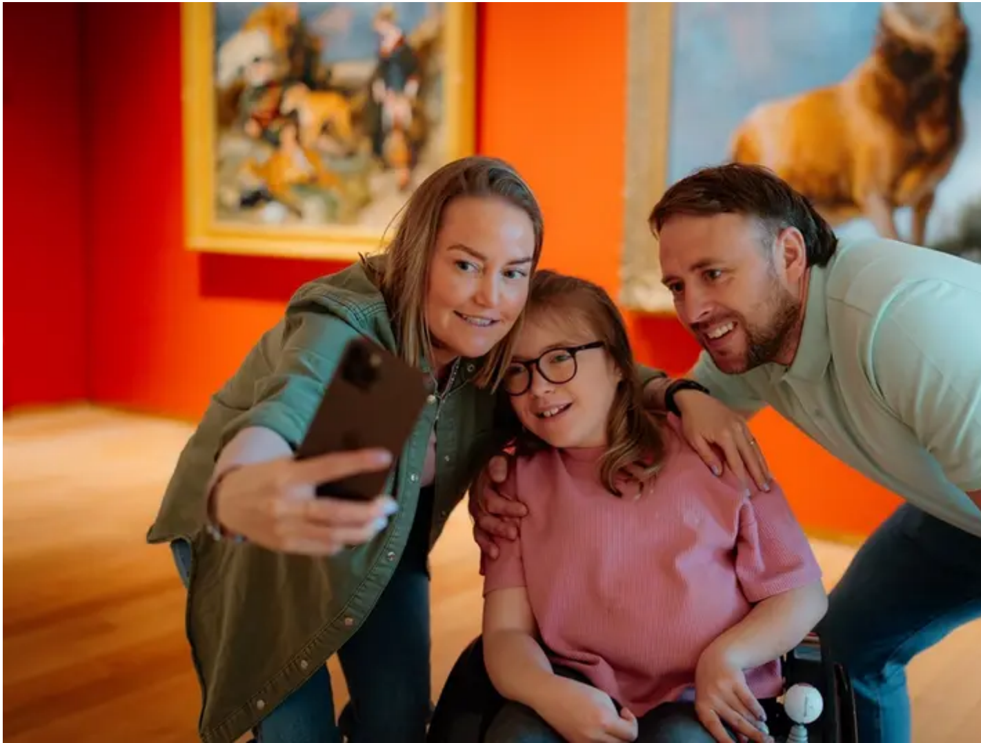
Visitors to the Scottish galleries pose for a selfie with Monarch of the Glen.