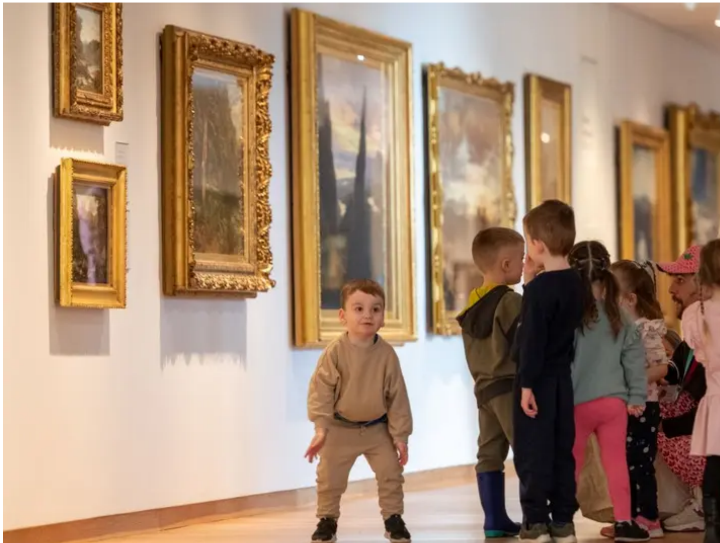
A nursery group visit the Scottish galleries for a learning session.