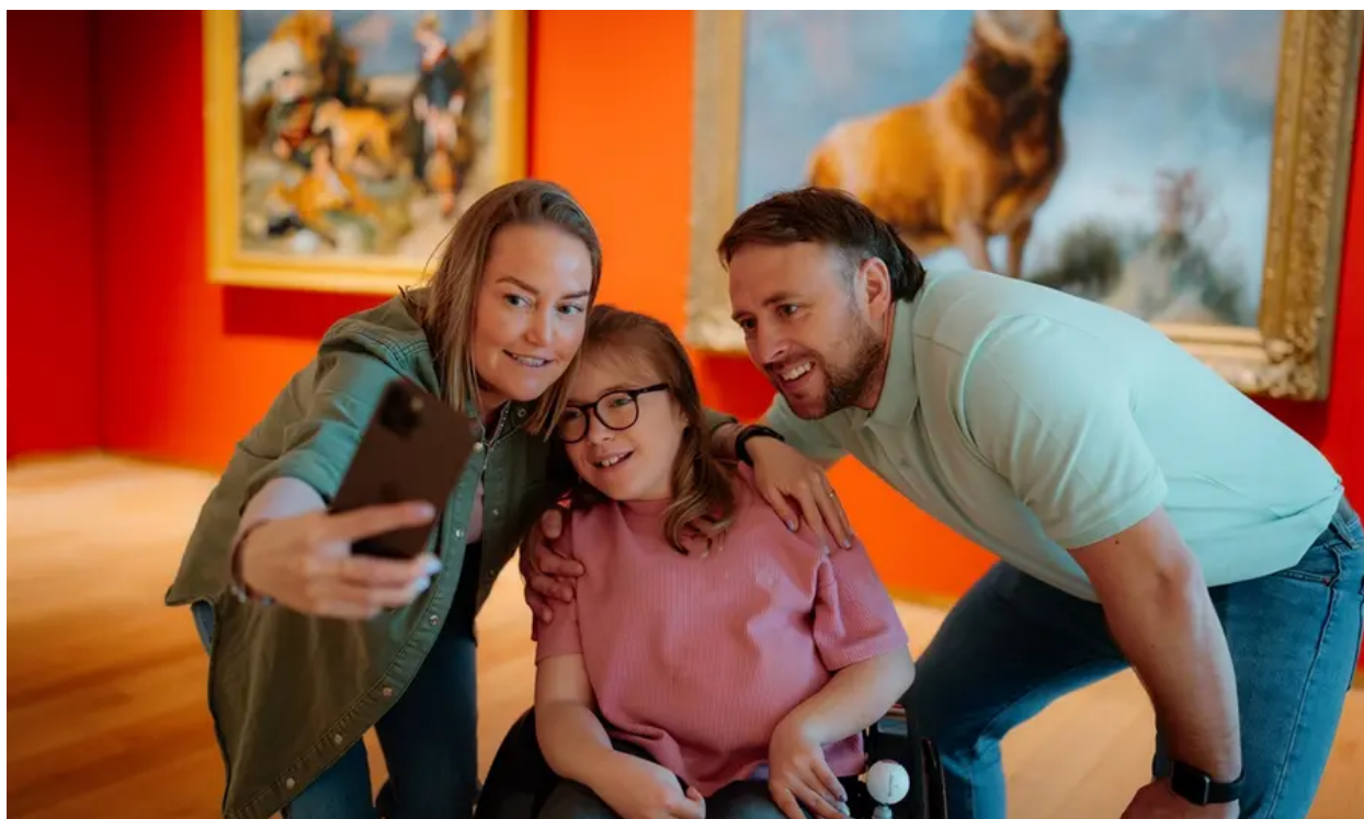
Visitors to the Scottish galleries pose for a selfie with Monarch of the Glen.