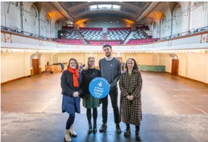
their own histories