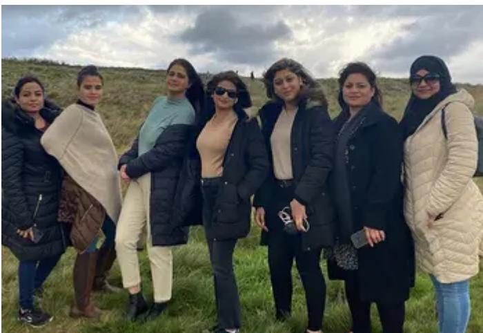
Project aims to explore and fill gaps in the archives