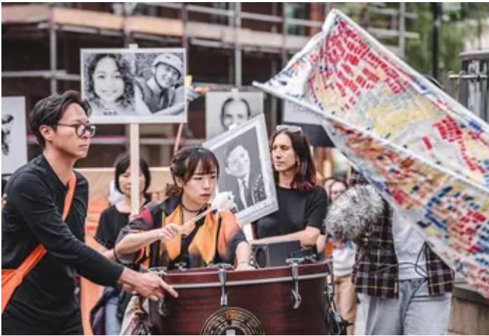
Project awarded £5million