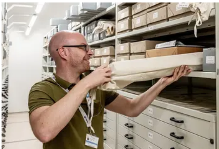
Liverpool Record Office.

The next round of applications for grants opens on Monday 24 February. If you are interested in applying or have questions about the process, join a webinar hosted by The National Archives on Thursday 6 March.