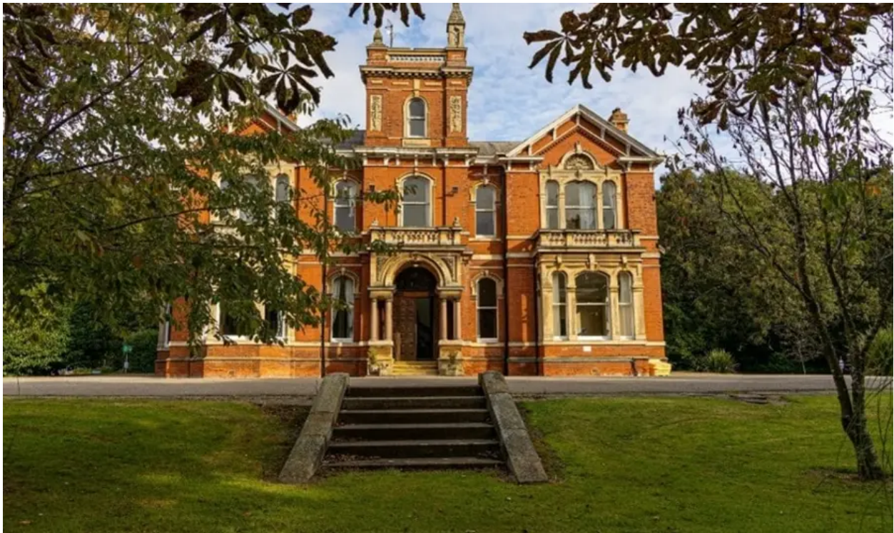
The exterior of Weelsby Hall.