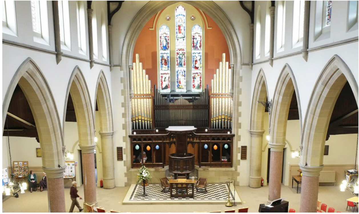
The organ in United Reformed Church, Jesmond.

In Bulmer, St Martin's Church will use our £248,504 grant to conserve and improve the thermal efficiency of its 14th century tower and enhance access and participation by strengthening links with the community.