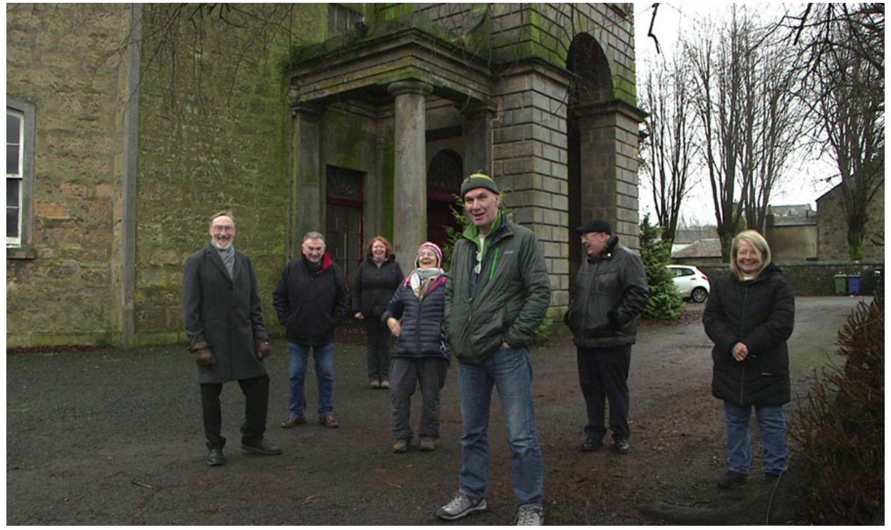
The Lochwinnoch Community Development Trust standing outside the church in Renfrewshire.