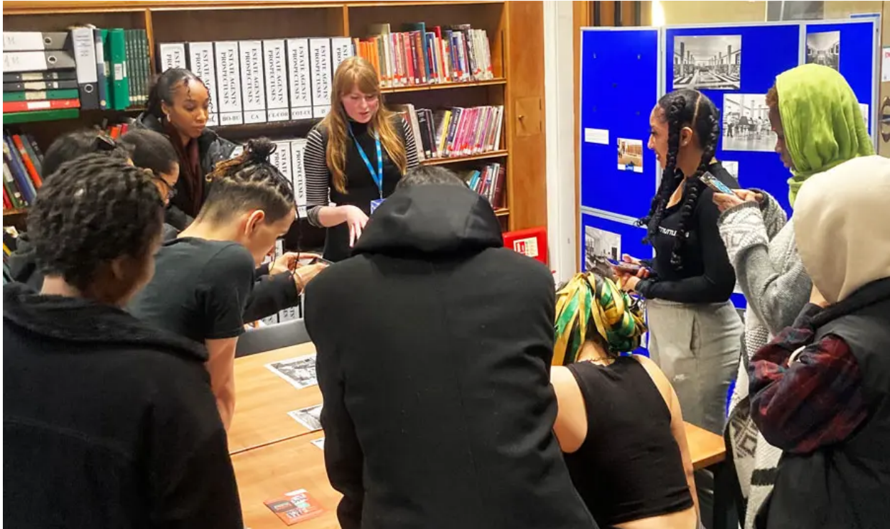
A workshop to research and tell the stories of diversity in British history.

Connected Heritage was a project run by Wikimedia UK, which taught people new skills through digital participation. Volunteers received training through online webinars, enabling them to learn at their own pace, from their own home. They then helped contribute to preserving and sharing heritage by publishing content to the site, helping to build digital skills capacity and confidence across the UK heritage sector.