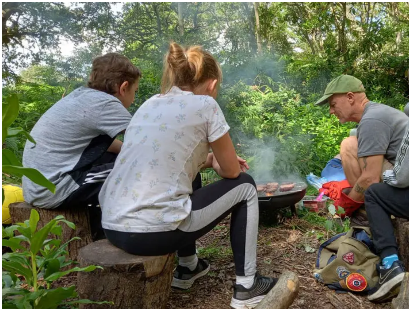
A group of young people engage in outdoor activities.

Project activities included an archaeology week for schoolchildren and youth-led heritage courses. The training programme tackled the anti-social behaviour on the estate by finding positive ways for young people to feel welcome and have their say in its future.