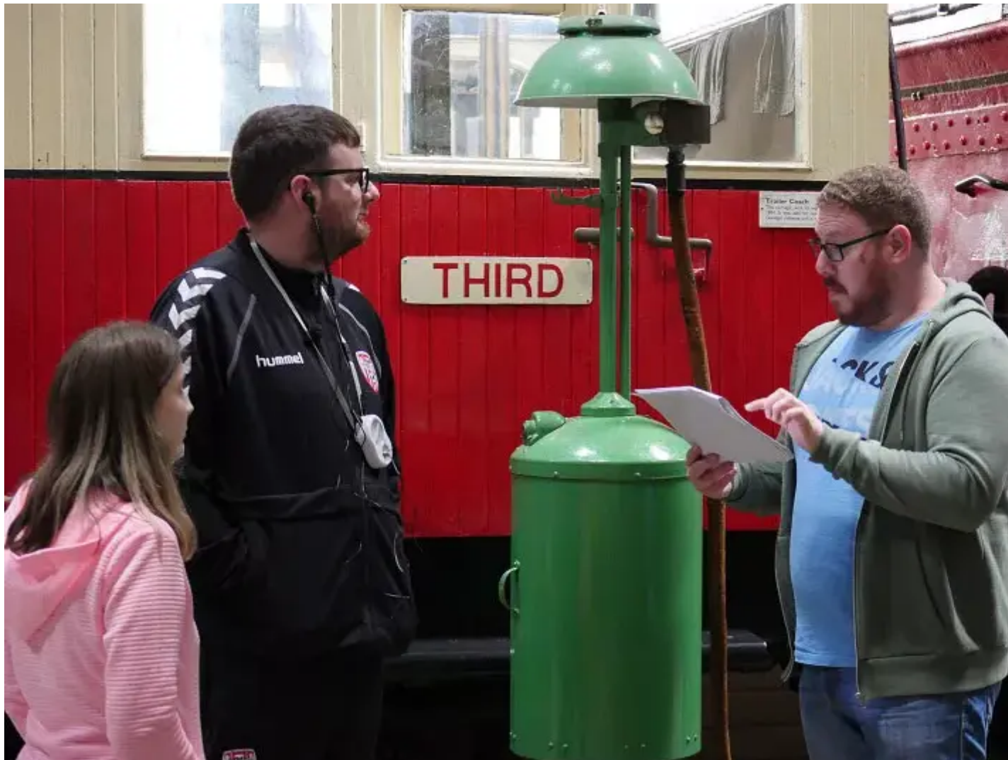
Museum tour training session.

The Foyle Valley Railway and Transport Museum worked with community support organisation, Destined, to actively involve people with learning disabilities in creating an inclusive visitor attraction. The group advised on sensory-friendly tours and accessible augmented reality visualisations – and were paid for their expertise.