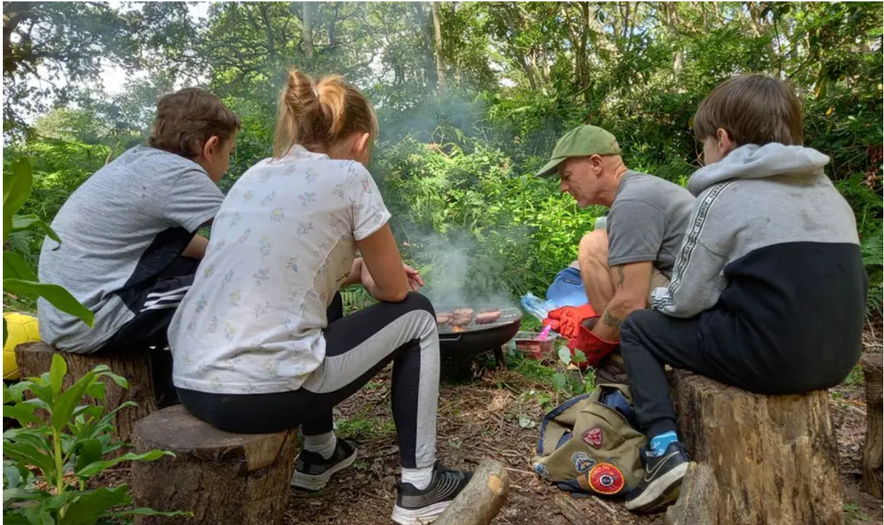
A group of young people engage in outdoor activities.

Project activities included an archaeology week for schoolchildren and youth-led heritage courses. The training programme tackled the anti-social behaviour on the estate by finding positive ways for young people to feel welcome and have their say in its future.