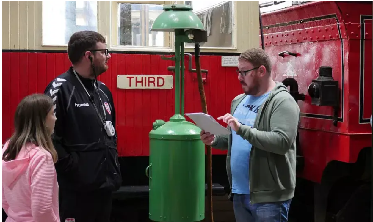
Museum tour training session.

The Foyle Valley Railway and Transport Museum worked with community support organisation, Destined, to actively involve people with learning disabilities in creating an inclusive visitor attraction. The group advised on sensory-friendly tours and accessible augmented reality visualisations – and were paid for their expertise.