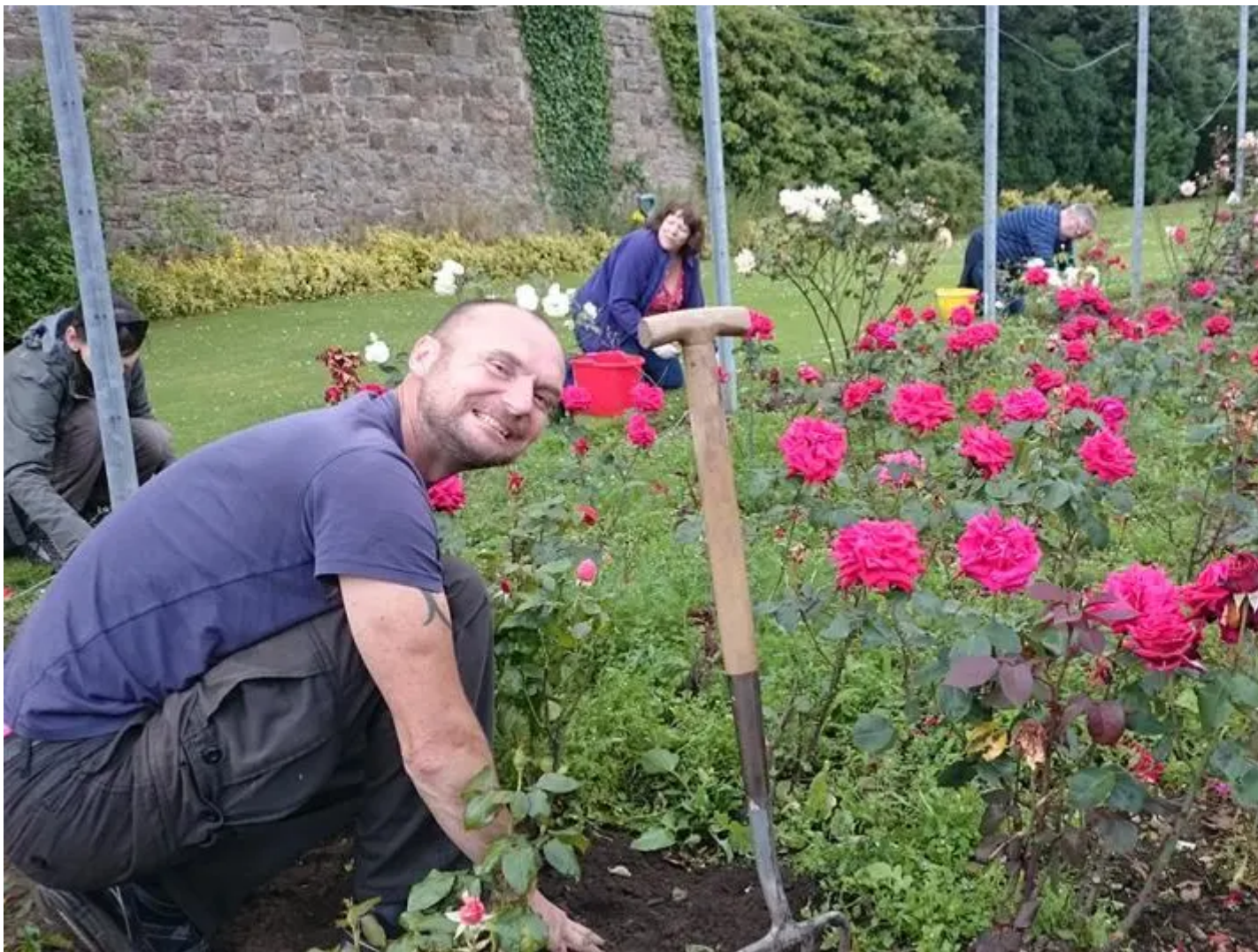
Volunteers tend to roses in the restored gardens.

One FoSP member says: “It’s green space in quite a developed area, it means lots of things to different people, it might be nature, it might just be some green space, it might be some volunteering ... It’s important that the park has lots of different things going for lots of different groups coming in.”