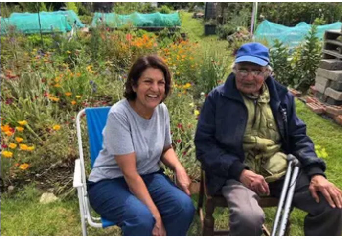
The Birmingham Allotment Project participants enjoying their plot.