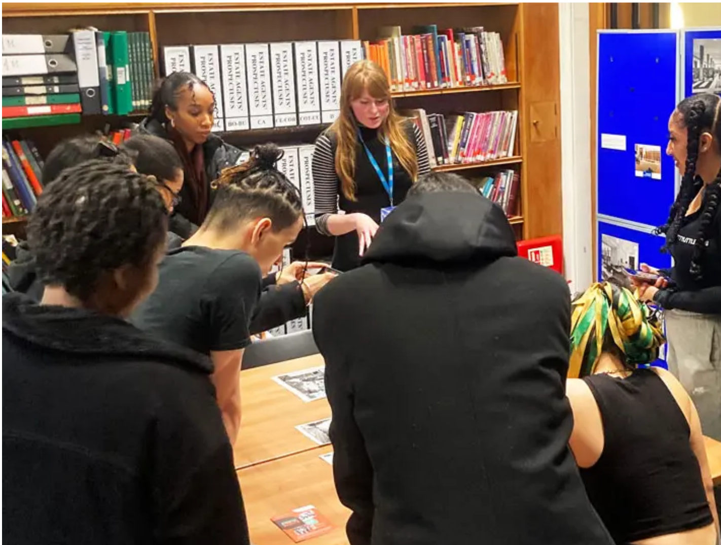
A workshop to research and tell the stories of diversity in British history.

Connected Heritage was a project run by Wikimedia UK, which taught people new skills through digital participation. Volunteers received training through online webinars, enabling them to learn at their own pace, from their own home. They then helped contribute to preserving and sharing heritage by publishing content to the site, helping to build digital skills capacity and confidence across the UK heritage sector.