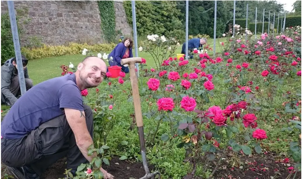
Volunteers tend to roses in the restored gardens.

One FoSP member says: “It’s green space in quite a developed area, it means lots of things to different people, it might be nature, it might just be some green space, it might be some volunteering ... It’s important that the park has lots of different things going for lots of different groups coming in.”