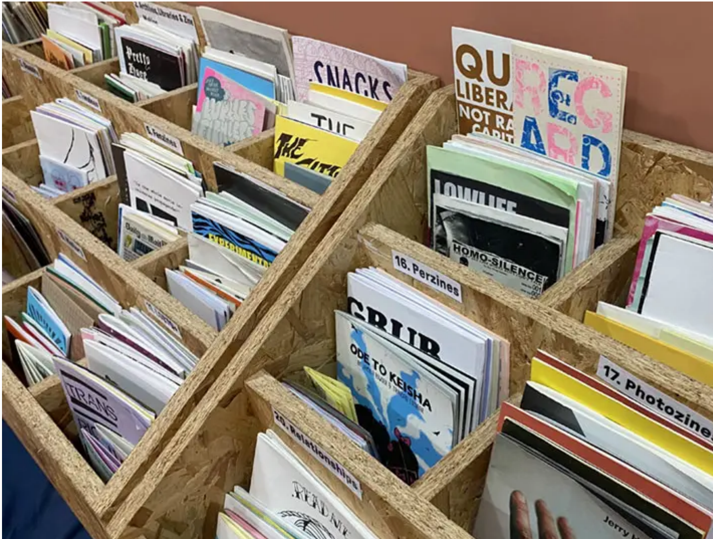
Part of Glasgow Zine Library's collection of zines

It’s a self-made publication created and distributed cheaply, usually in small quantities. It can be hand-written, typed, drawn, cut-and-pasted or almost anything else you can imagine.