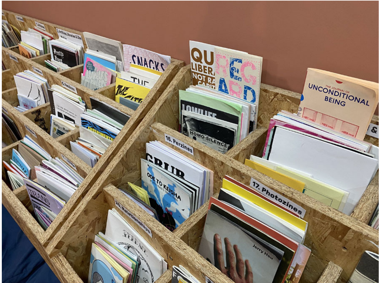
Part of Glasgow Zine Library's collection of zines

It's a self-made publication created and distributed cheaply, usually in small quantities. It can be hand-written, typed, drawn, cut-and-pasted or almost anything else you can imagine.