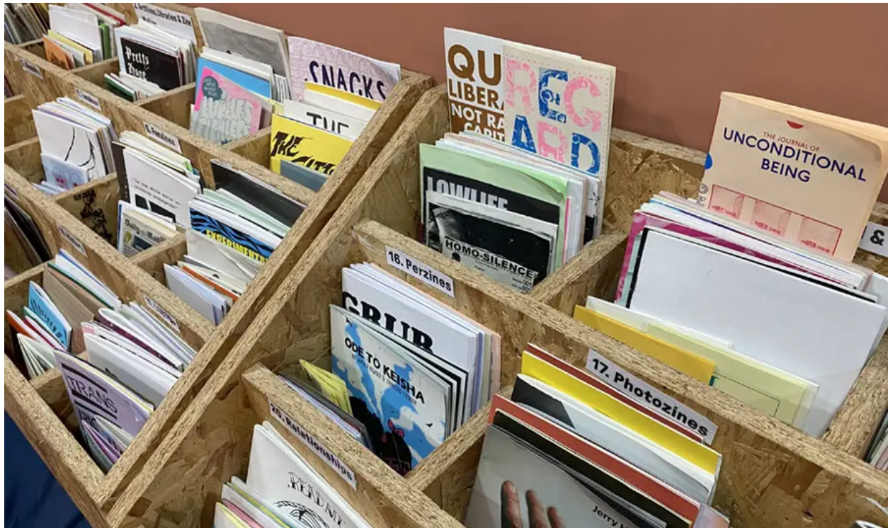
Part of Glasgow Zine Library's collection of zines

It's a self-made publication created and distributed cheaply, usually in small quantities. It can be hand-written, typed, drawn, cut-and-pasted or almost anything else you can imagine.