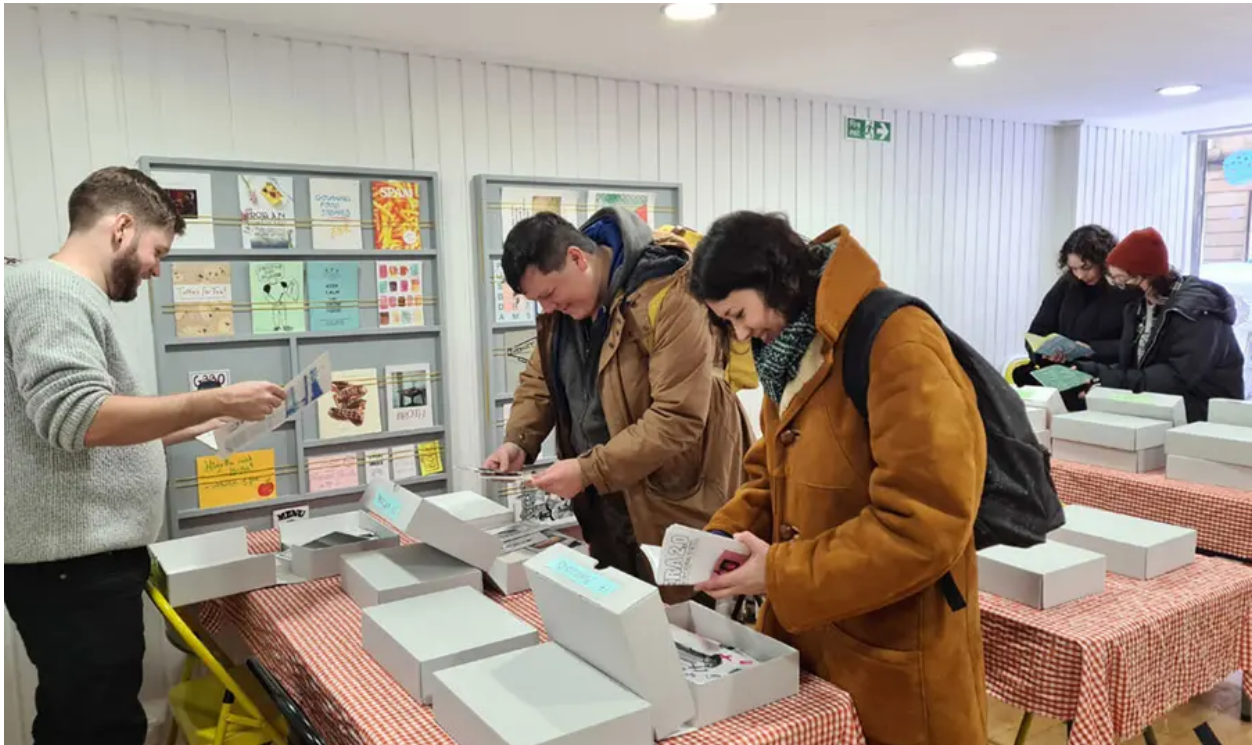
Visitors exploring zines at an open day at Glasgow Zine Library

It is also supporting a project to digitise and make zines available online.