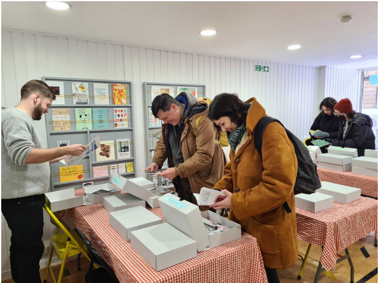
Visitors exploring zines at an open day at Glasgow Zine Library

It is also supporting a project to digitise and make zines available online.