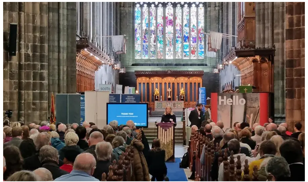
Our £491,000 grant to the Development Trust Association Scotland was announced at an event at Paisley Abbey.