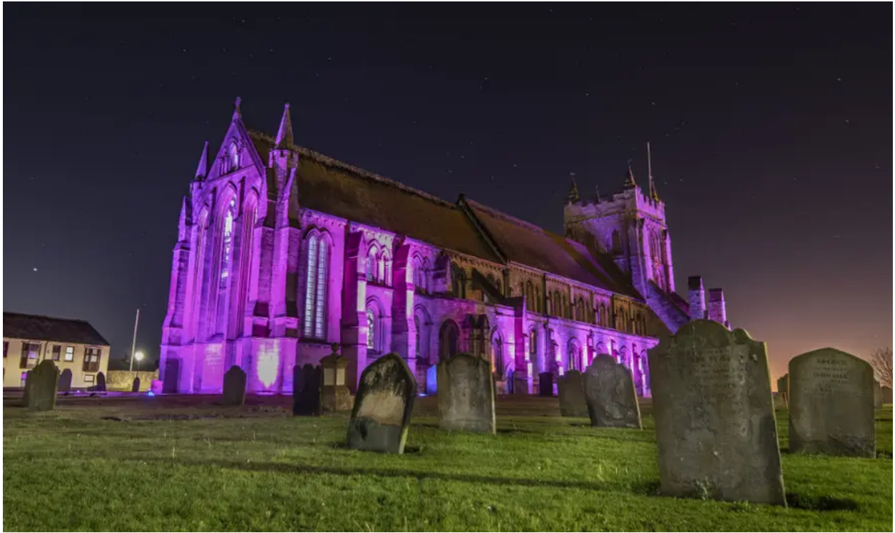
Built on the site of a sixth-century century monastery on a dramatic headland, the history of St Hilda's Church harks back to Northumbria's earliest Christian history.