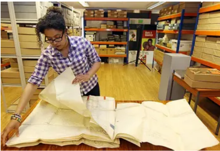
Black Cultural Archives.

We fund collection-based projects that help preserve and celebrate the heritage of people, places and all our passions. Get inspired by browsing some of the other museum, library and archive projects we’ve supported.