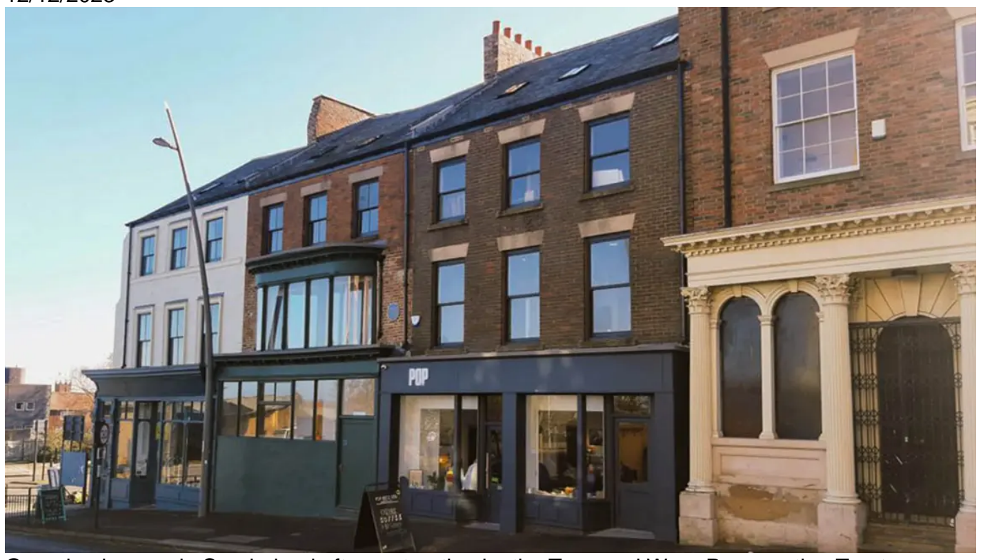
Georgian houses in Sunderland after restoration by the Tyne and Wear Preservation Trust. Our £5 million partnership with The Architectural Heritage Fund will support local organisations from Cornwall to Caernarfon and Derry/Londonderry to Aberdeenshire.

Empowering social enterprises and charities to breathe new life into disused and at risk heritage buildings is at the core of the Heritage Development Trust programme. Working together with The Architectural Heritage Fund (AHF), we invited organisations to join the programme earlier this year.