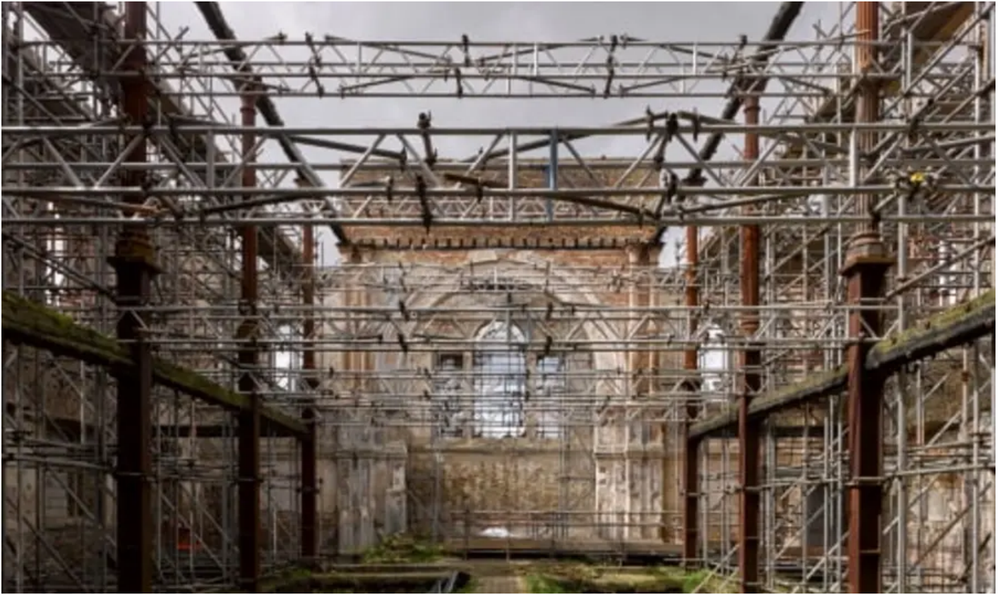
Sheerness Dockyard: before.