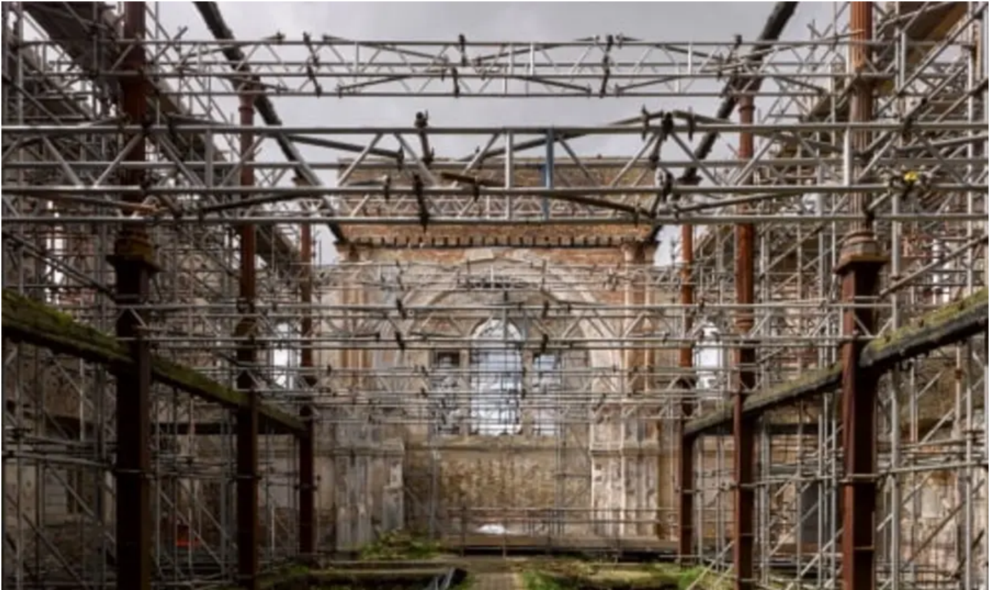
Sheerness Dockyard: before.