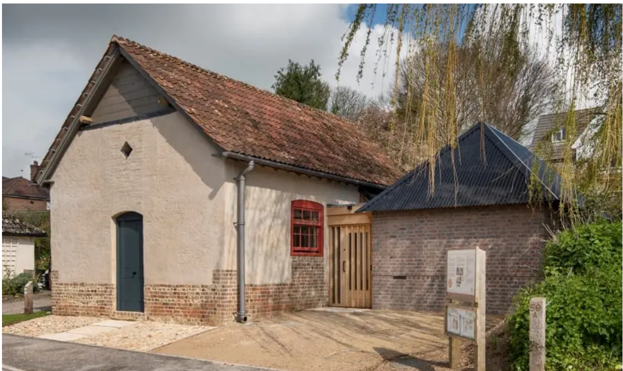
Tolpuddle Old Chapel.

“Saving heritage at risk so that it can be valued, cared for and sustained for everyone, now and in the future, is core to our purpose, and we’re incredibly proud to have been able to support the important work to make this fantastic news possible.”