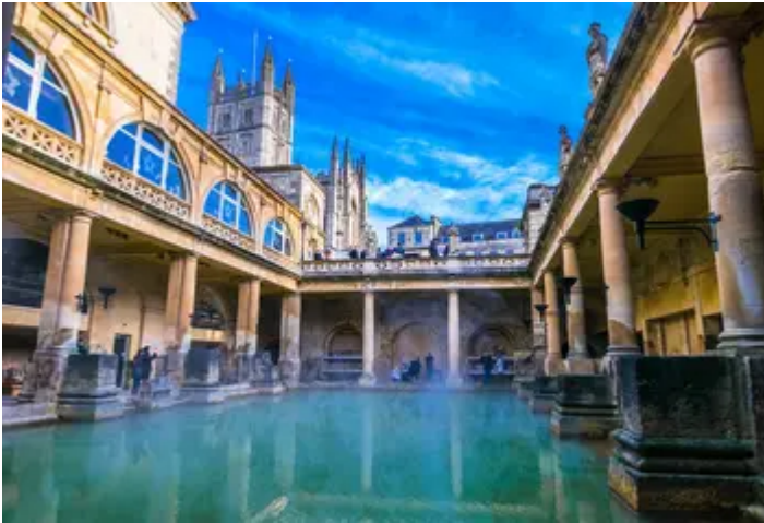
Roman Baths, Bath © 2017 aroundworld/Shutterstock.

Thanks to National Lottery players, since 1994 we have awarded over £2.8billion to more than 6,800 historic building, monument and area projects across the UK. As well as safeguarding places for future generations, these projects support employment and economic growth and can foster a sense of pride in the community.