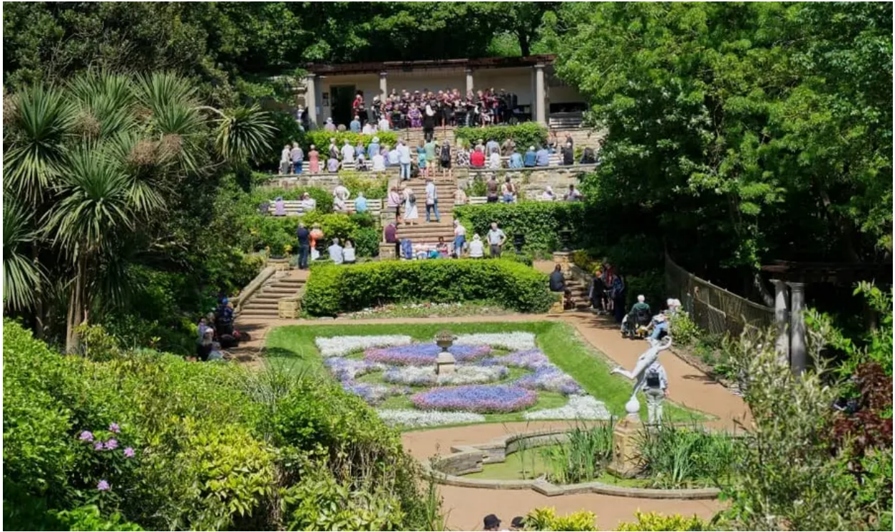
South Cliff Gardens.