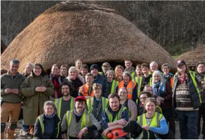
Some of the team stand in front of the newly completed roundhouses.