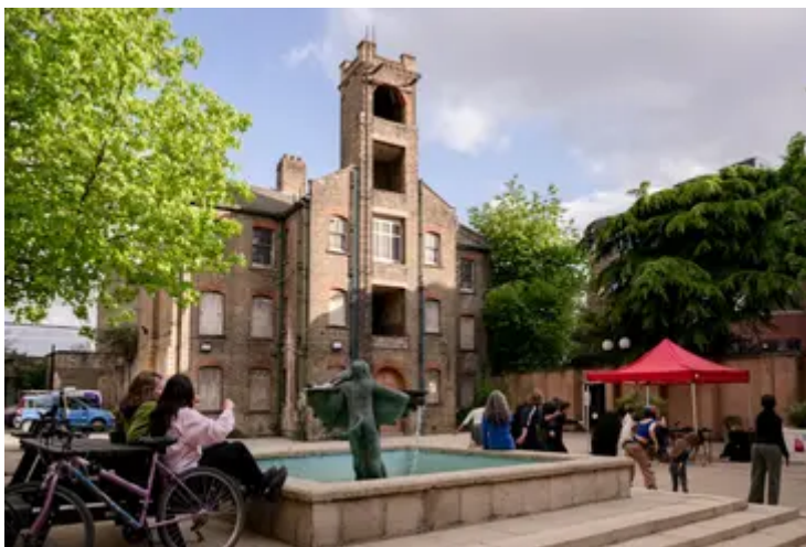
Alice Billings House, Stratford

Seven more organisations have been awarded development funding to finalise plans for creating community hubs for engagement, education, creativity and wellbeing: