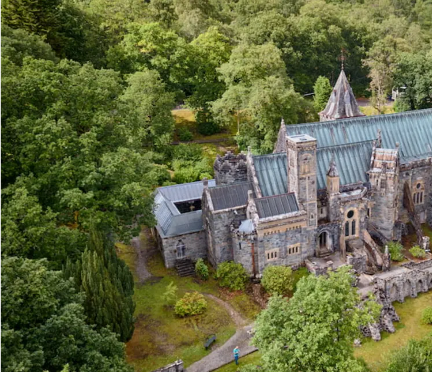
St. Conan's Kirk, Argyll, Scotland

From the only thatched ice house of its kind to the oldest picture house in Northern Ireland, we have awarded 12 heritage buildings life-saving support.