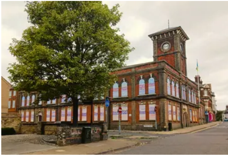
Lowestoft Town Hall, Suffolk

This 'at risk' building is set to become a thriving, sustainable Gateway Community Hub. The project, which will also receive £1m from the future High Streets Fund via Medway Council, will revitalise heritage in Chatham for generations to come.