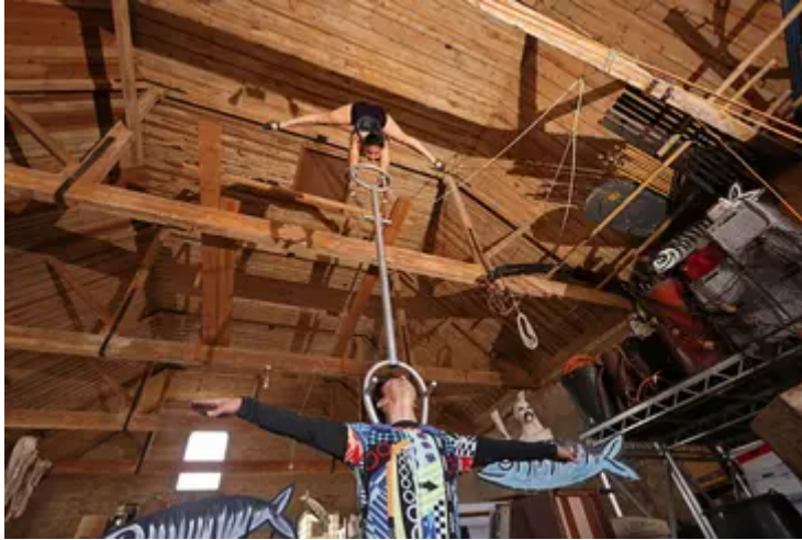
Duo Vita Circus perform at the Ice House in Great Yarmouth