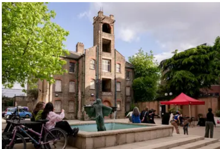
Alice Billings House, Stratford

Seven more organisations have been awarded development funding to finalise plans for creating community hubs for engagement, education, creativity and wellbeing: