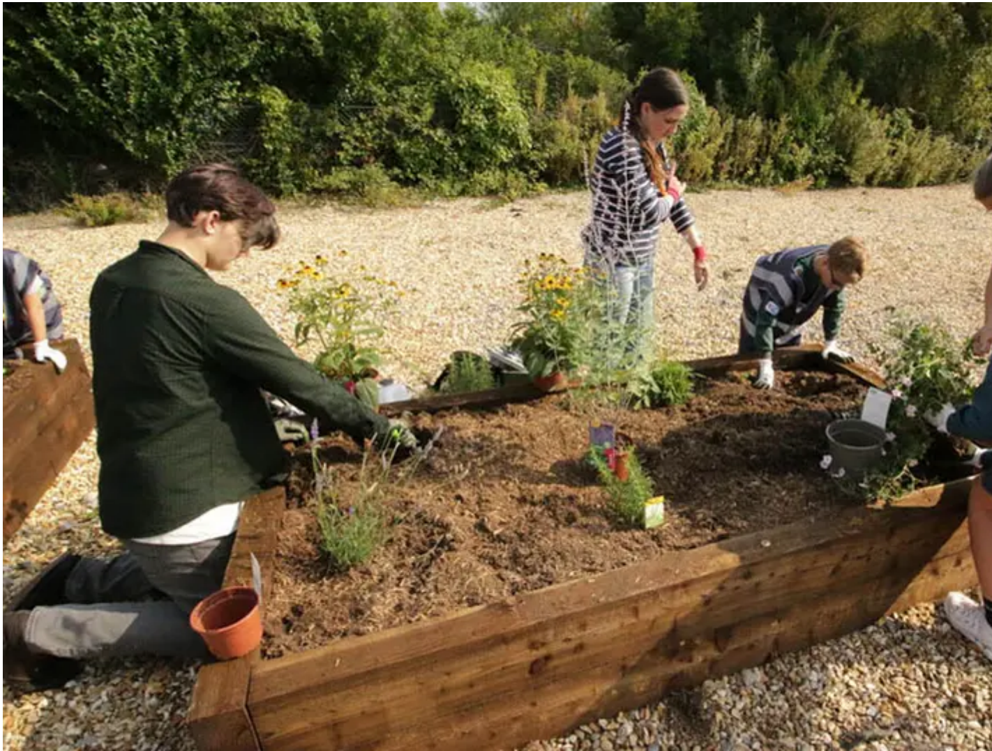
Scouts planting as part of Transport for Wales' Green Routes project.