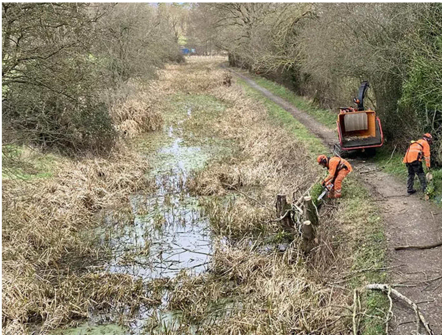
Workers cleaning overhanging tree branches on a section of the Montgomery canal.