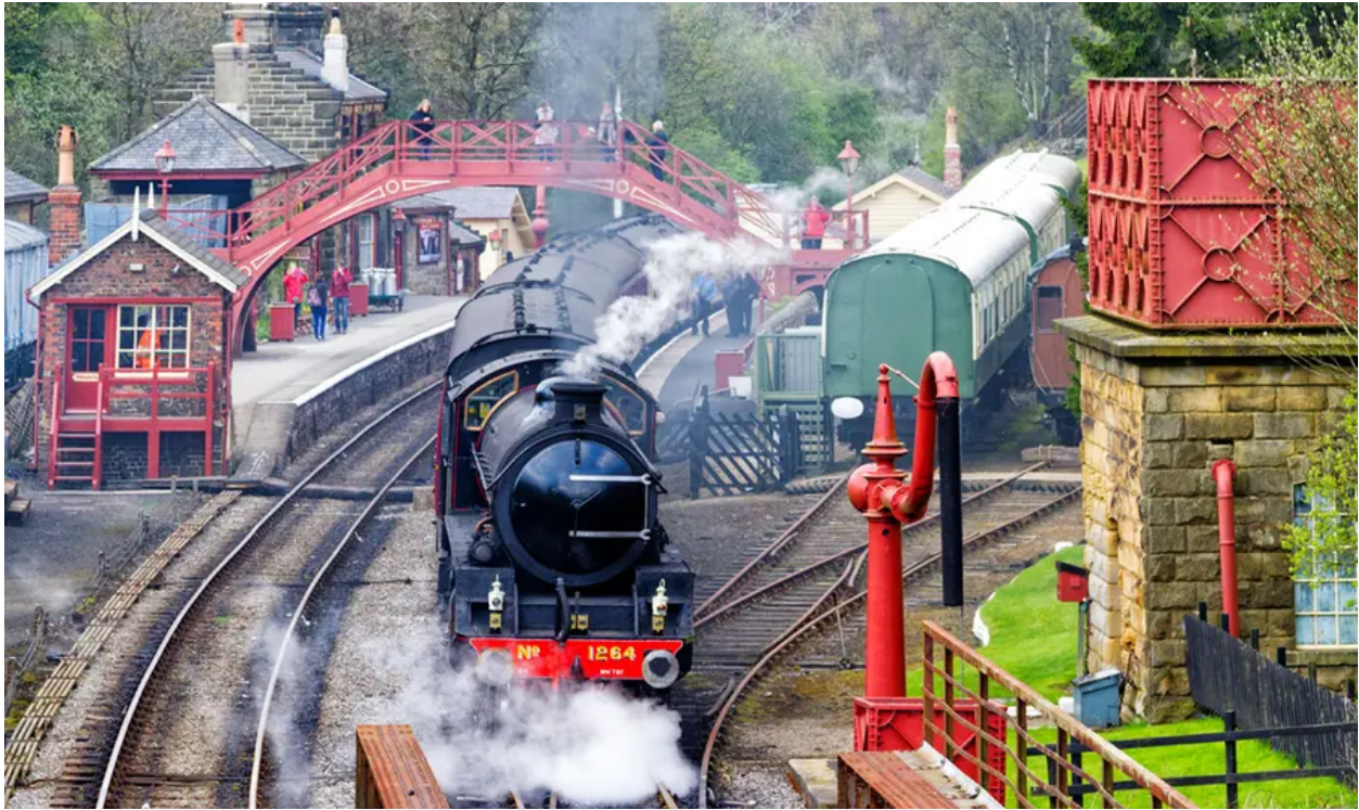
North York Moors Railway © Milosz Maslanka/Shutterstock.