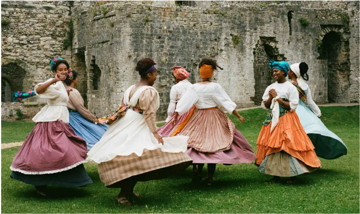
Porchester Castle, Hampshire