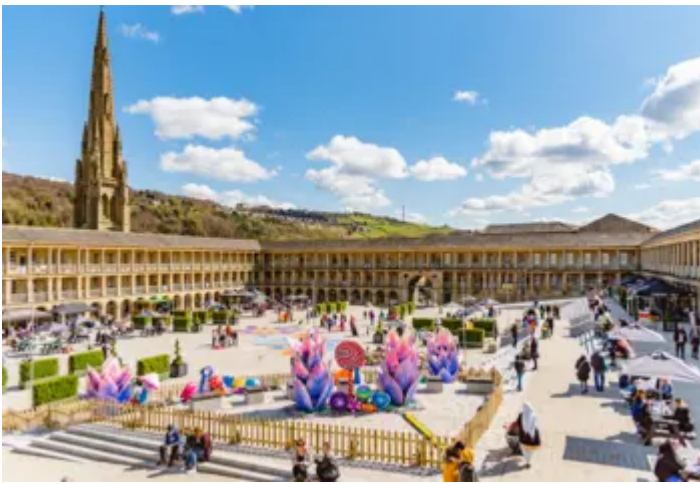
An event in the courtyard of The Piece Hall, which was revitalised with the help of National Lottery funding.

You can now apply for grants up to £10million