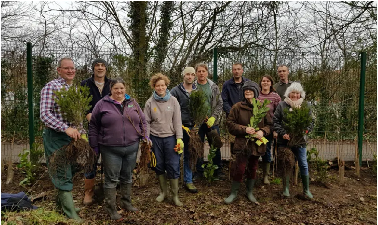
Planting new hedgerow at the museum.

The Food Museum was chosen for its campaign Hedgerow, which demonstrated sustainable thinking at its core.