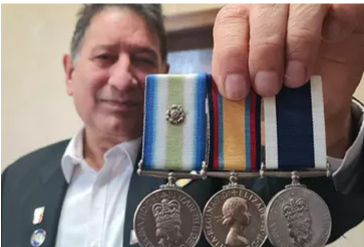
Commonwealth Contribution Memories.

Pupils from Bowling Park Primary School worked with a local author, illustrator and historian to create an immersive picture book telling the story of Bradford.