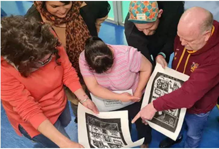
'Special' Histories of Bradford.