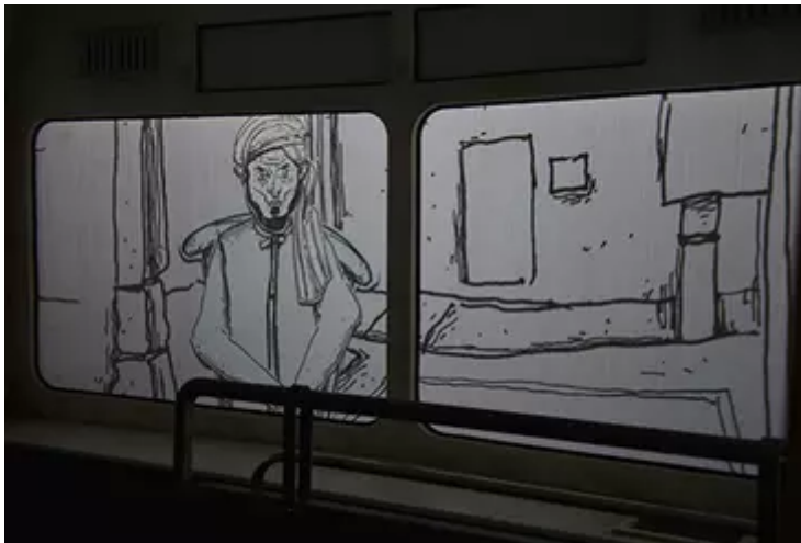
Bussing Out artwork.

The project used an exhibition and dance show to explore the stories of scrap metal collecting in Bradford. It included the tale of a young traveller girl from a 'rag-and-bone' family who makes musical instruments from materials she finds. Devised by young people, it will soon visit Bradford's libraries and community centres.