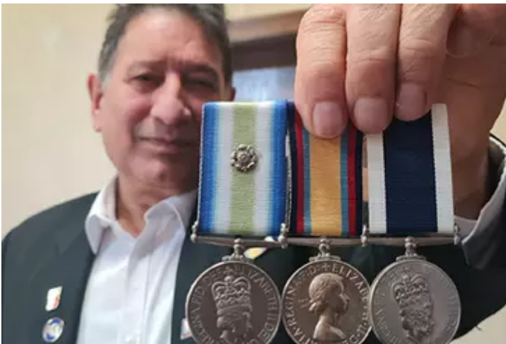
Commonwealth Contribution Memories.

Pupils from Bowling Park Primary School worked with a local author, illustrator and historian to create an immersive picture book telling the story of Bradford.