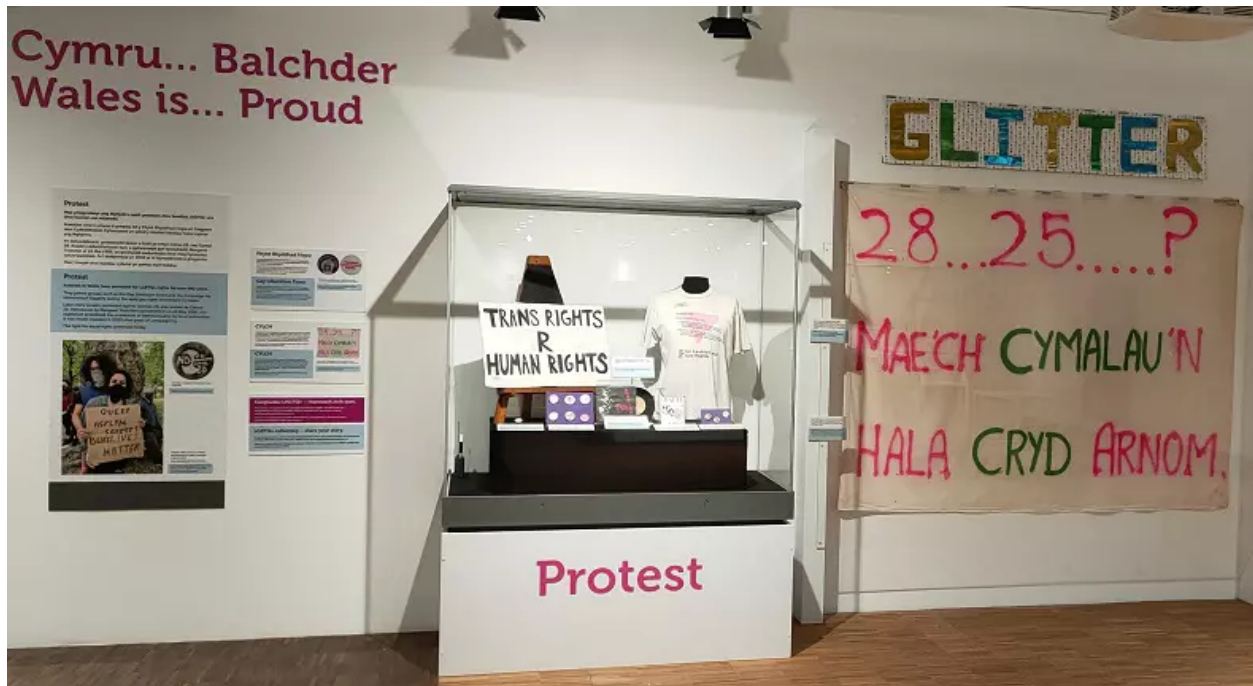
Part of 'Wales is... Proud' display at St Fagans National Museum of History.

"I am still working hard collecting from protests, pride events and through community groups. I feel the importance of the 'Wales is... Proud' display is that it has raised awareness of the LGBTQ+ collection, increased visibility for the community and shown that Amgueddfa Cymru is serious about making sure the community is part of the displays, events and learning programmes across our museum sites."