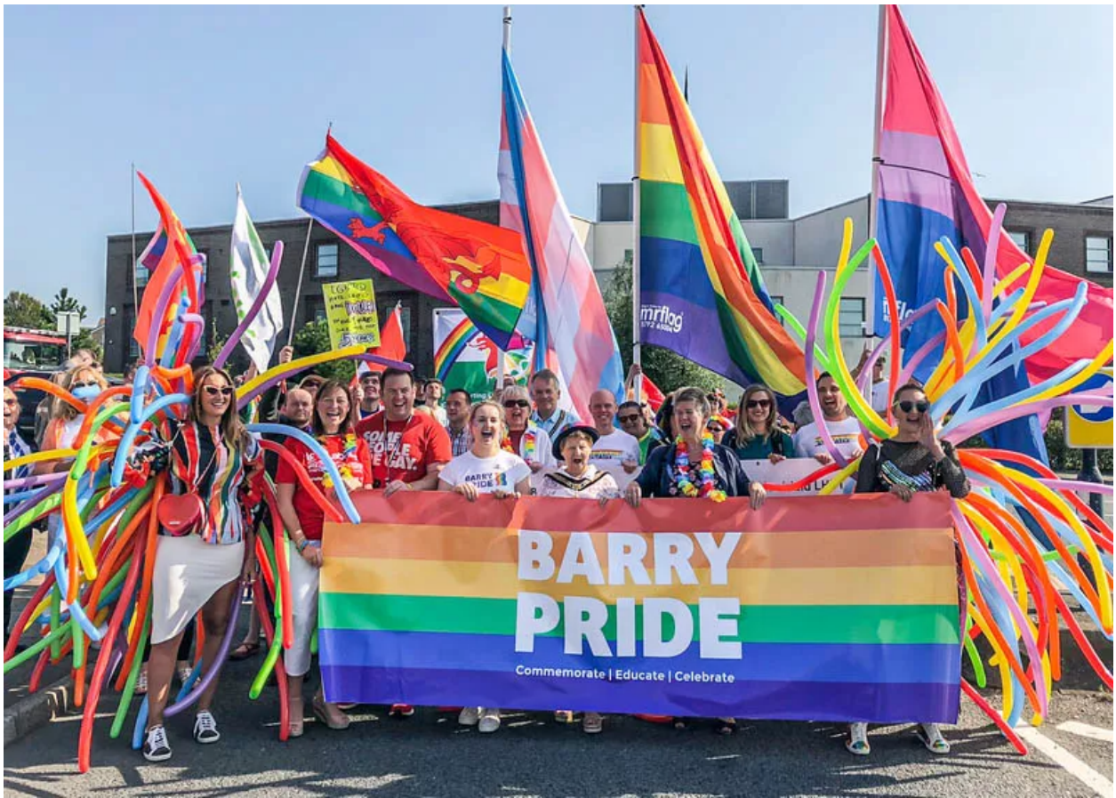
The first Barry Pride held on 21 September 2019.

Though there is still a long way to go, it signifies how far things have come and it's becoming increasingly more important – the 2021 census revealed that the highest proportion of young people in England and Wales who do not identify as heterosexual live in a rural Welsh county.