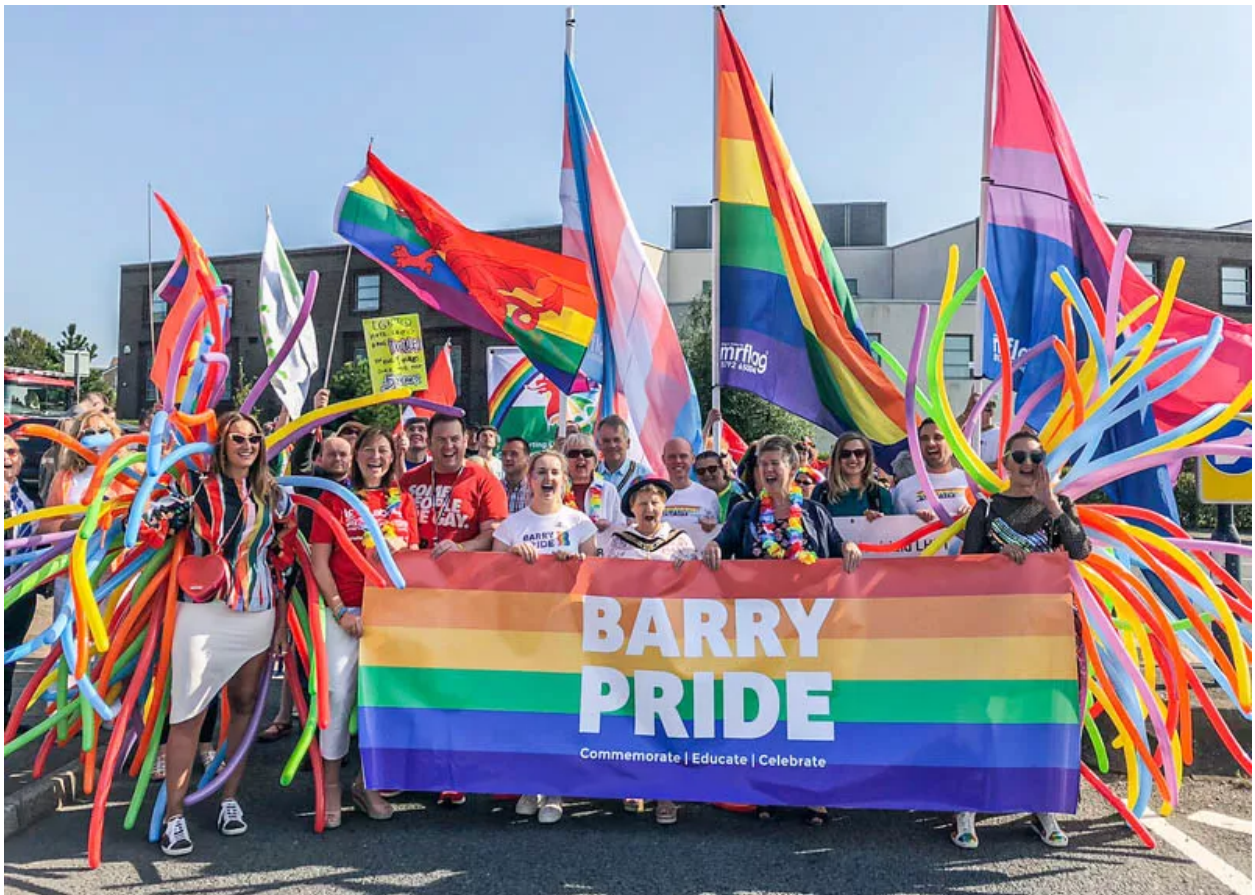
The first Barry Pride held on 21 September 2019.

Though there is still a long way to go, it signifies how far things have come and it's becoming increasingly more important – the 2021 census revealed that the highest proportion of young people in England and Wales who do not identify as heterosexual live in a rural Welsh county.