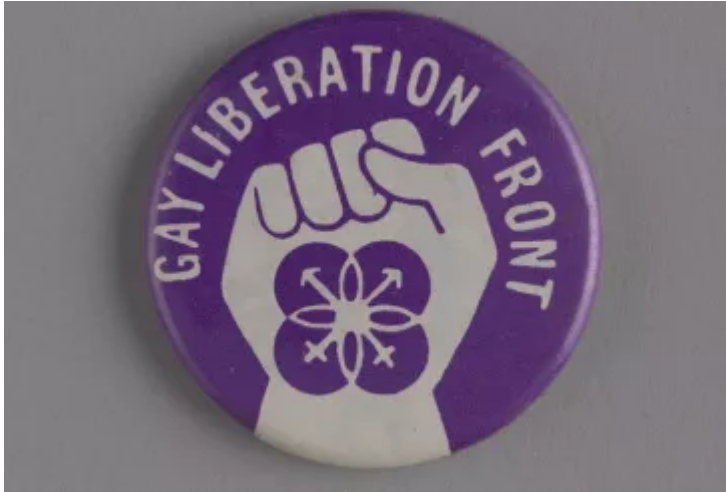
Cardiff Gay Liberation Front badge, 1970s.

St Fagans National Museum of History – one of Europe's biggest open-air museums which completed a redevelopment project in 2018 – is showcasing some objects in the collection as part of its 'Wales is... Proud' display. Visitors can see: