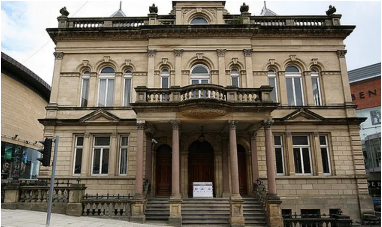
St Columb's Hall in Derry/Londonderry