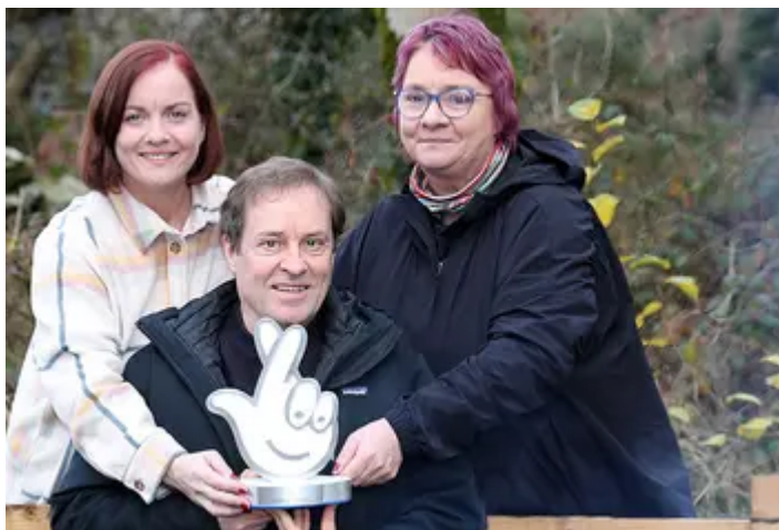
Ardal O'Hanlon presents the An Tobar team with their National Lottery Award.