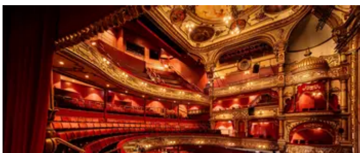
National Lottery support