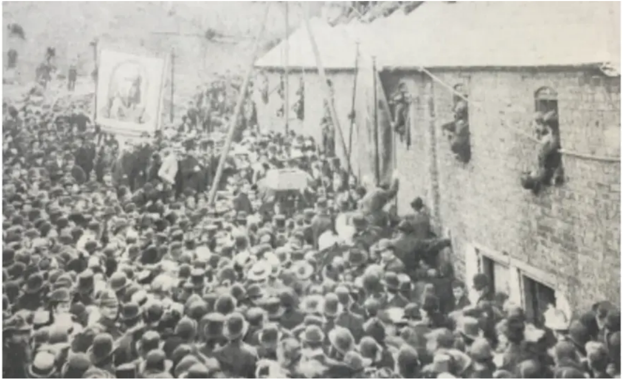
A large group gathers in 1886 as St Columb's Hall foundation stone is laid.