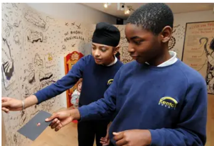
Children enjoying an exhibition at Seven Stories, Newcastle upon Tyne

Our Dynamic Collections funding campaign comes to an end on 24 April 2023. If you are inspired by these projects, find out how to apply . You can still apply for support for collections-based projects via our open programmes at any time.