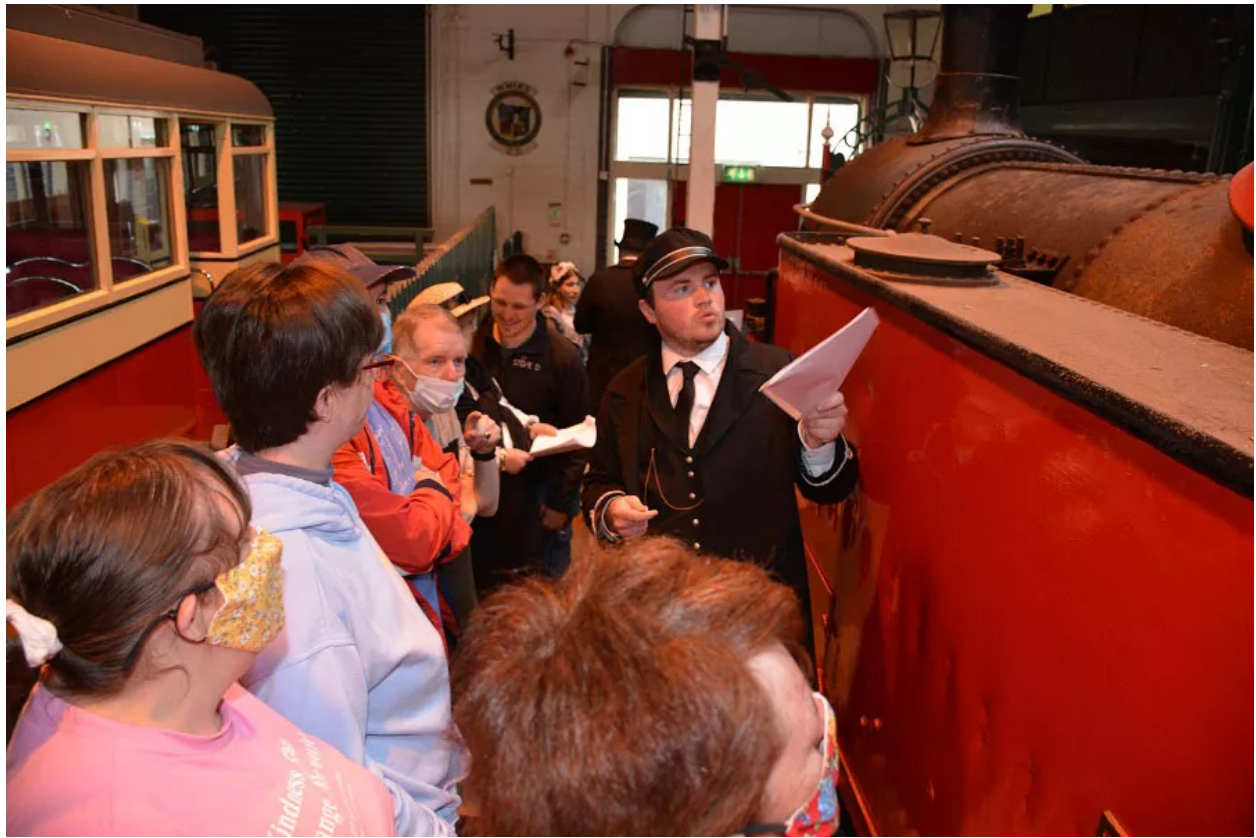
Open day tour.

Removing the hierarchy of project leaders versus participants fosters co-creation and ensures the work is fully informed by people who best understand the need for it.