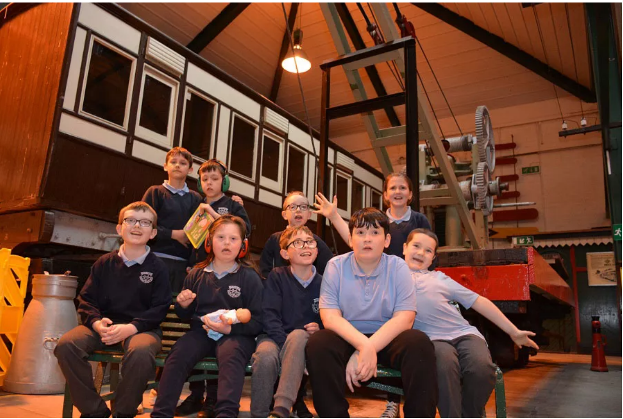
School visits to the museum.

"Not only does it brings young people into a heritage setting, it gives them a better understanding of diversity through engagement with people with learning disabilities."