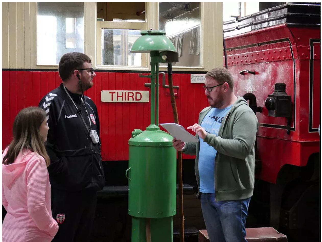
Museum tour training session.

The involvement of people with learning disabilities led to the interpretive centre including: