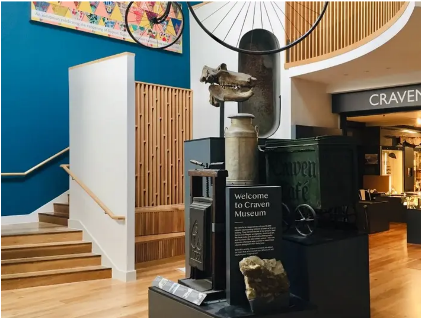
The Craven Museum and Gallery in Skipton scored 60 in the benchmark, placing it third out of the museum and heritage sites surveyed.

“When venues contact us regarding their score, it's important to remind them that even small changes to their access information can make a difference in how someone with access requirements may perceive their site.”