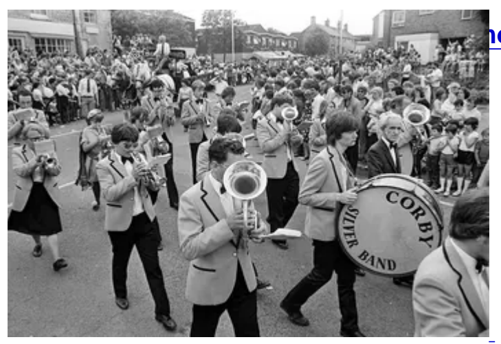
Corby Pole Fair 1982.