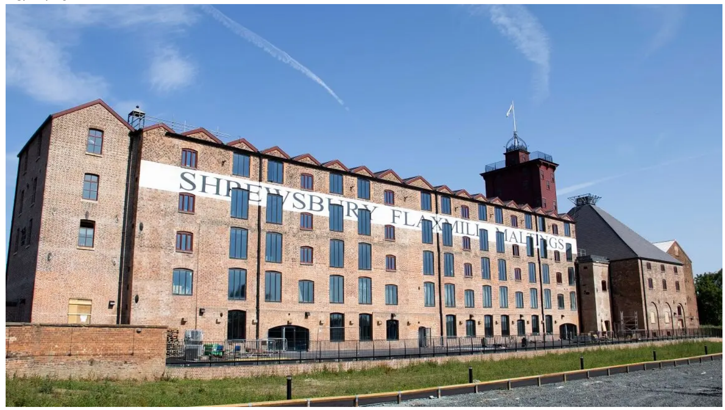
The historic Shrewsbury Flaxmill Maltings - the 'grandparent of skyscrapers' - has opened its doors again following 35 years of closure thanks to £20.7million National Lottery funding.

Four listed buildings on site are now fully restored: the Smithy, Stables, Main Mill and Kiln. Their redevelopment has been led by Historic England and The Friends of Shrewsbury Flaxmill.