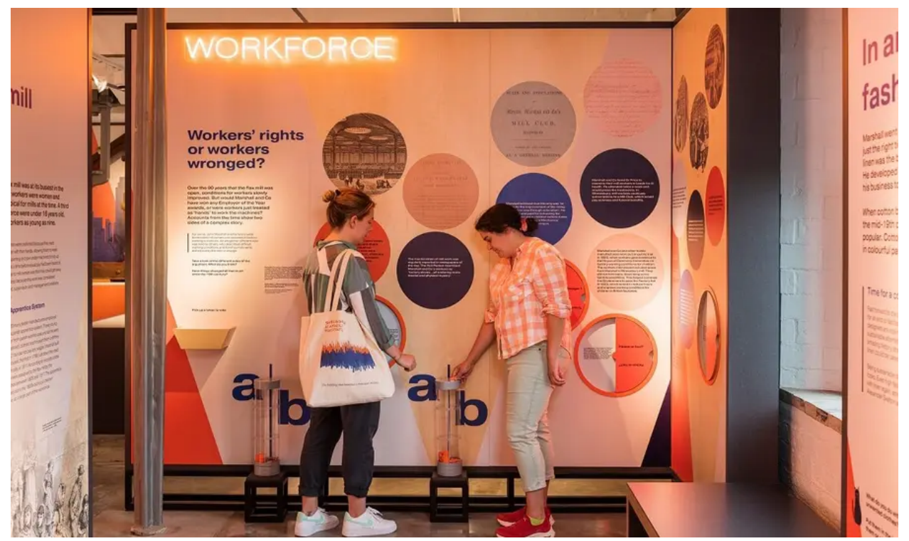
The new exhibition 'The Mill'.