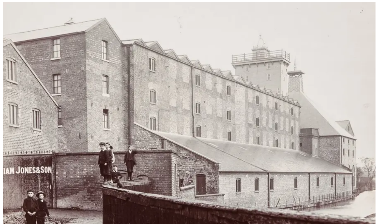
19th century image of the site after it had been adapted for use as a maltings.